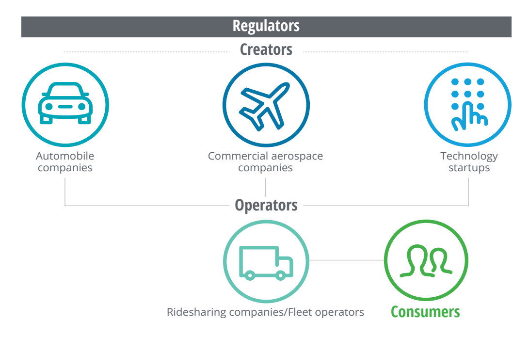
The elevated future of mobility ecosystem: Consumers are the key