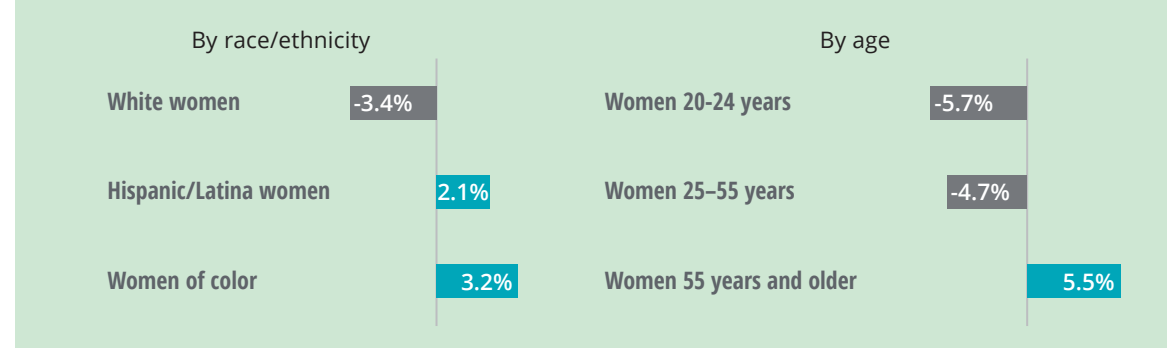
How the pandemic impacted women's jobs in financial services firms Percentage of job gains/losses, 2020 vs. 2019

Source: Deloitte \ Center \ for \ Financial \ Services \ analysis \ of \ 2020 \ US \ Bureau \ of \ Labor \ Statistics' \ Current \ Population \ Survey.