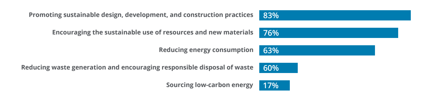
Figure 4. Top priorities of E&C companies to drive sustainability

Many customers are becoming more sustainability conscious and placing greater pressure on developers to lower the carbon footprint of new construction. The increasing global focus on climate change could incentivize construction companies to factor sustainability into their projects, construction processes, and designs (figure 4).