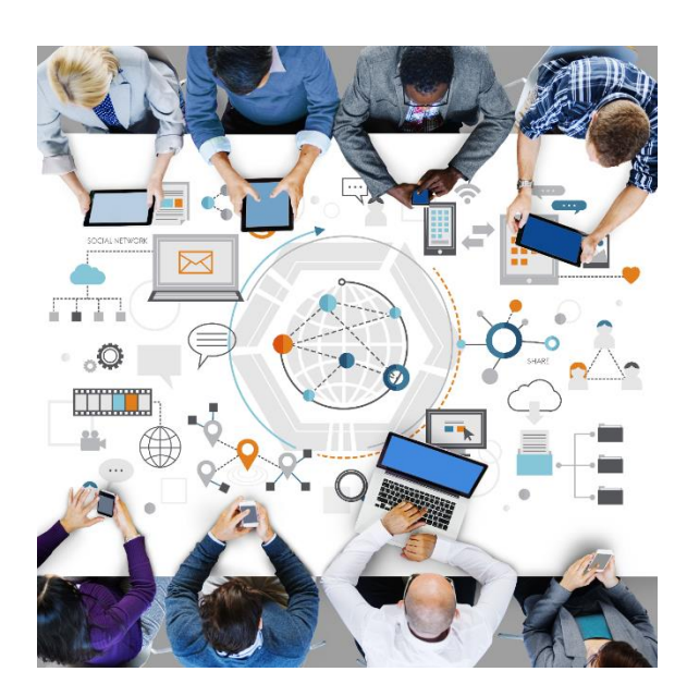
People, not systems, drive innovation

While Technology plays an important role in keeping Fintechs ahead of the competition, talent plays an equally important role. With the rapid growth of the FinTech sector in the UK, the HR function will come under increasing pressure to acquire, grow and retain skilled professionals. To deliver on these expectations, FinTechs must build an effective people strategy as they scale.