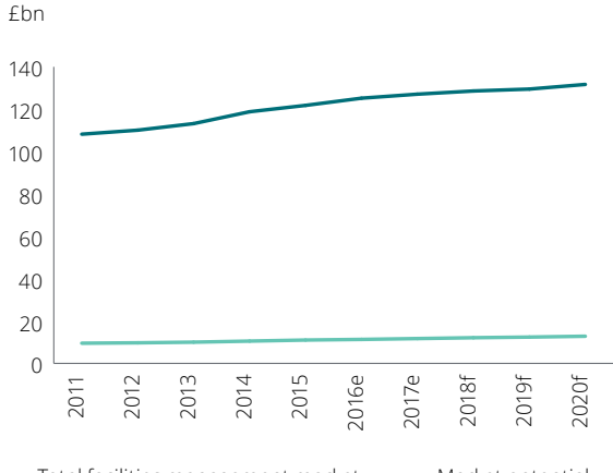
Figure 1. Total facilities management market vs market potential

Growth opportunities lie mainly with services that are still provided by multiple small vendors, or that are managed in-house. Encouraging clients to integrate multiple smaller contracts into bigger ones or contract out new elements of facilities management could help reduce costs for them and potentially make the delivery of services more effective. The UK sector is considered to be the most mature compared to the rest of Europe which can give UK FM companies an edge over others in terms of quality and technical expertise when competing internationally.