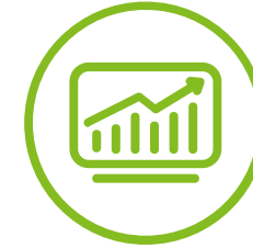
Scope 2 and 3 Emissions Dashboard Views

When planning a Decarbonisation journey, the Oracle EPM platform can allow Finance Function/CFO's to evaluate the impact of initiatives, in terms of: