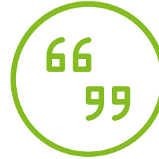
Definition of Decarbonisation Initiatives