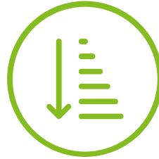
Top-Down Carbon Planning