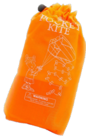
Pocket Kite from Whale and Dolphin Conservation £7.95