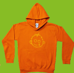
GOSH Hoodie from Great Ormond Street Hospital Shop £22