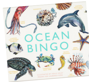
Ocean Bingo from Whale and Dolphin Conservation £19.99