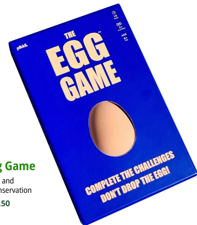
The Egg Game from Whale and Dolphin Conservation From £14.50