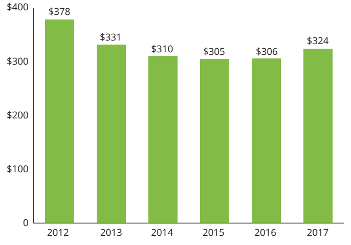
Figure 1. Evolution of smartphone ASP, 2012-17