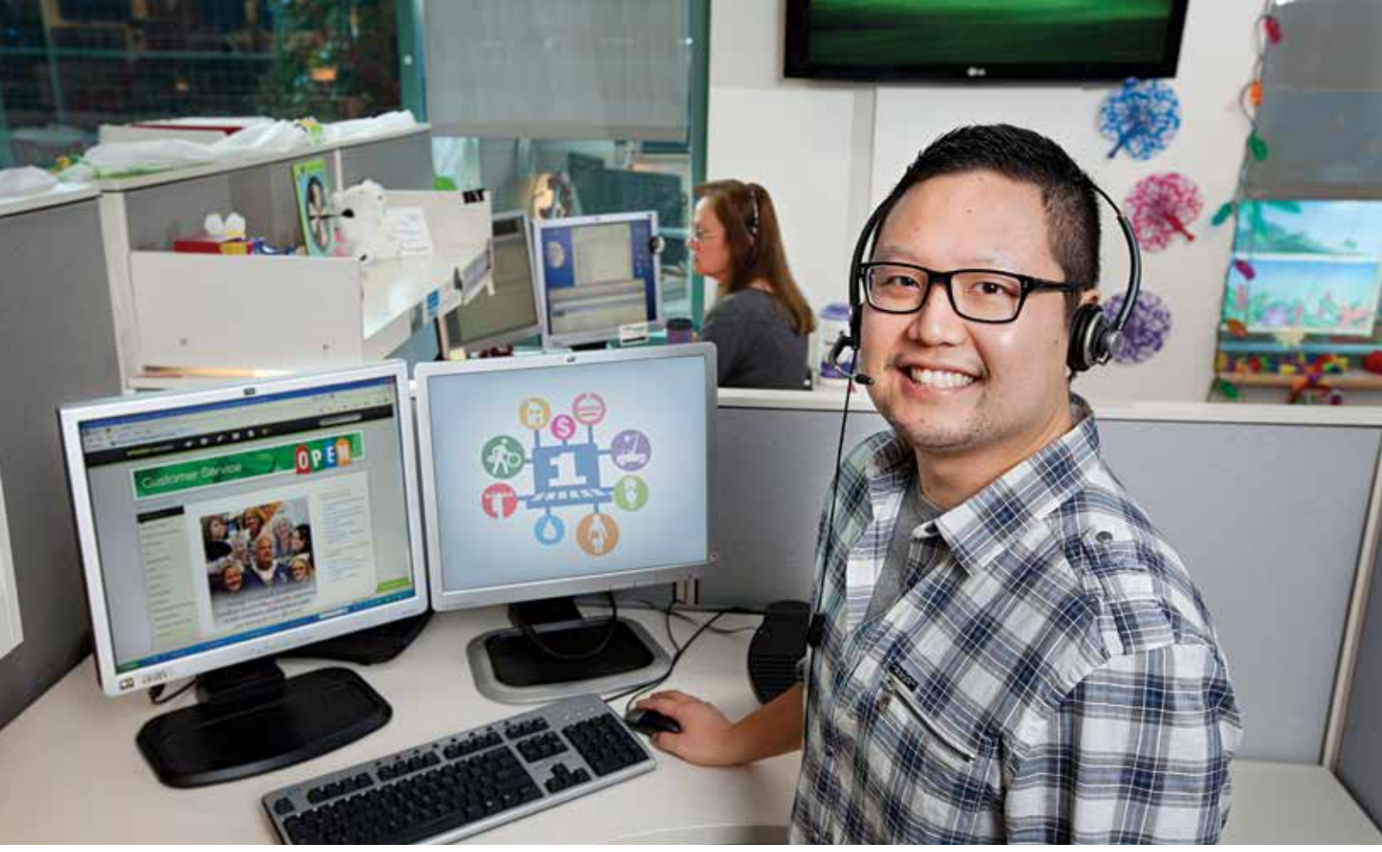
A Snohomish PUD employee at a work station