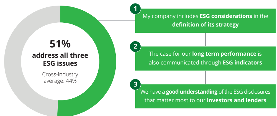
Fig. 1 – Share of CFOs reporting that all of the three given ESG considerations apply to their company