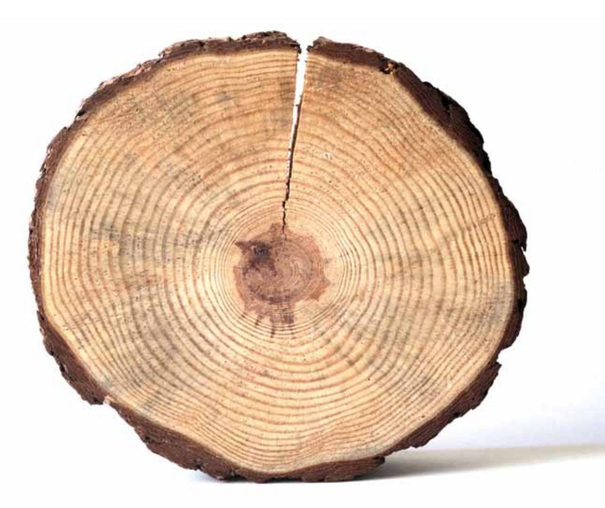
Internal Audit. A foundation of good corporate governance