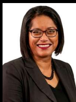
Barbara Edmonds MP for Mana, Chairperson of Finance and Expenditure Select Committee