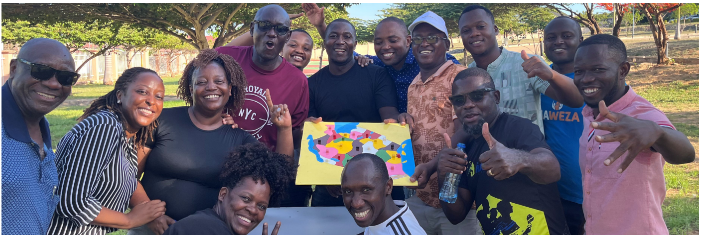
USAID Afya Yangu Southern leadership team during the team building activities at Annual Program Review in Dar es Salaam, © USAID Afya Yangu Southern/R.George