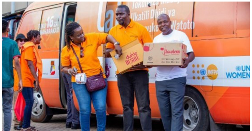
USAID Afya Yangu Southern staff in Morogoro during the 16 Days of Activism caravan, © USAID Afya Yangu Southern/J. Uwaya