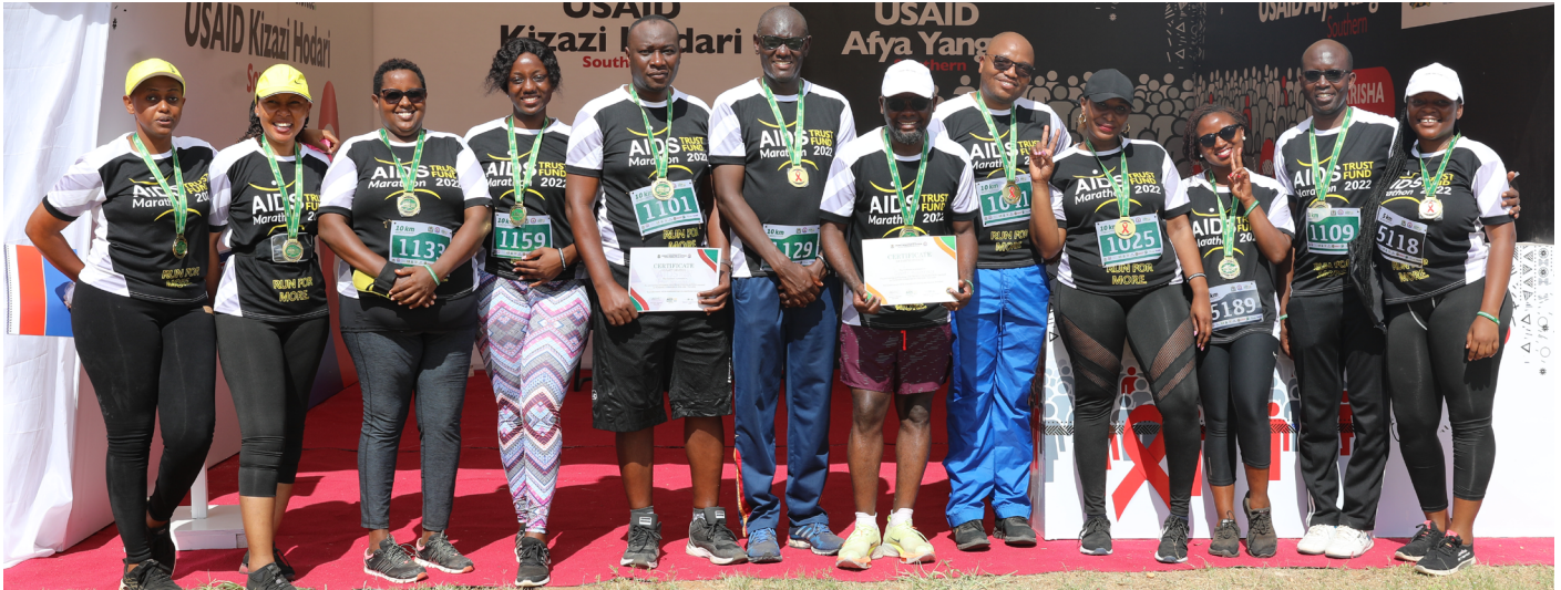
USAID Afya Yangu Southern and Kizazi Hodari Southern Activity team after the marathon

USAID Afya Yangu and Kizazi Hodari Southern programs participated in the AIDS Trust Fund marathon during the