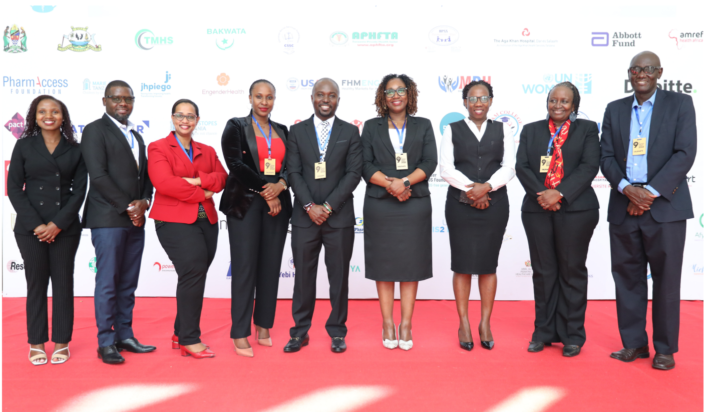
USAID Afya Yangu Southern team during the THS 2022