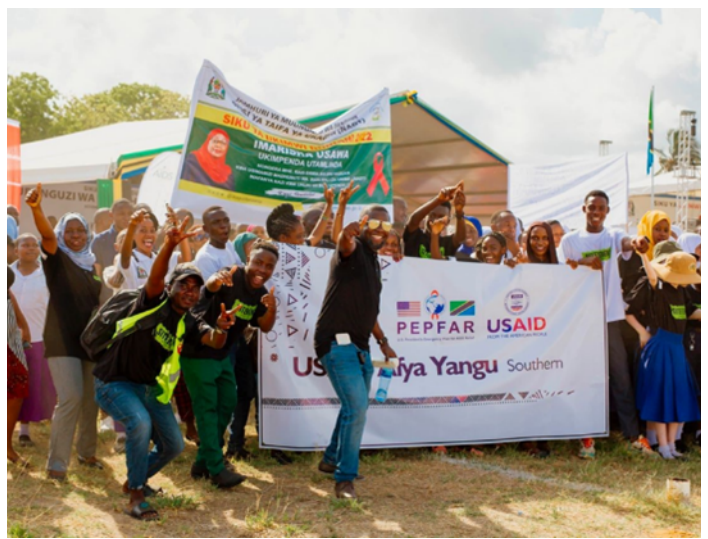
USAID Afya Yangu Southern team with its beneficiaries during the WAD 2022 Launch Event