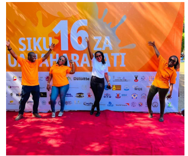
On the left, Hon. Dorothy Gwajima, Minister of Community Development, Gender, and Special Groups when she visited USAID Afya Yangu Southern booth, in the middle is program staff in a group photo with other partners, UN Agencies, and the Ministry of Community Development, Gender, and Special Groups, on the right its program staff on a group photo