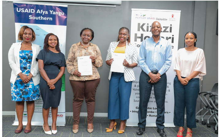
USAID Afya Yangu and Kizazi Hodari Southern Chief of Parties when they were signing the inter-function memorandum