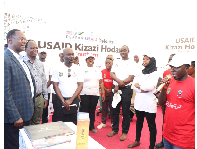
Minister of State, Prime Minister's Office, Parliament, Policy, and Coordination George Simbachawene visiting USAID Afya Yangu and Kizazi Hodari Southern booth