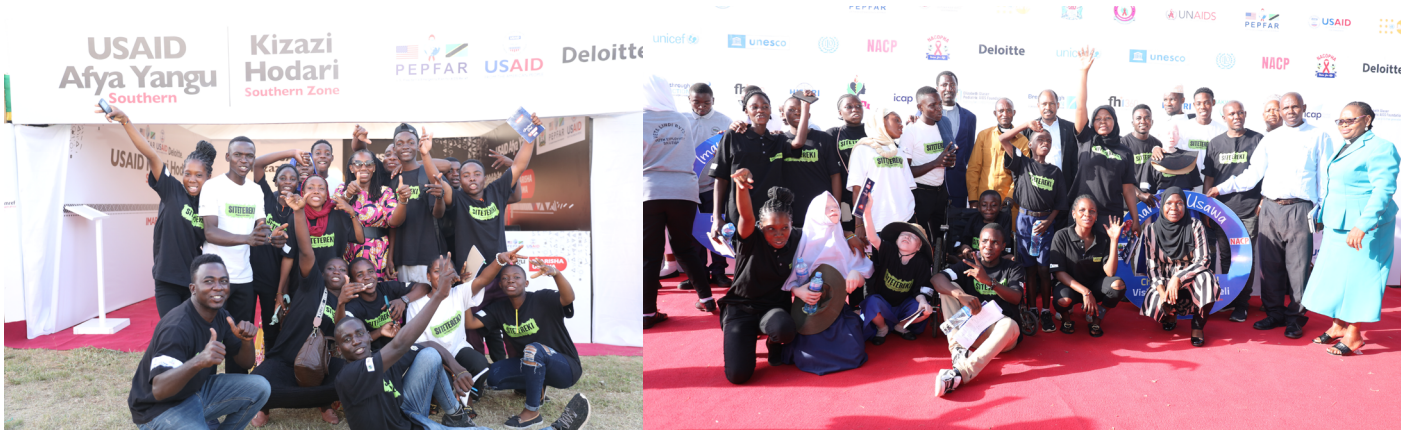
USAID Afya Yangu Southern Youth beneficiaries from Mtwara, Lindi, and Ruvuma in a group photo doing exhibitions during WAD 2022 at the USAID Afya Yangu and Kizazi Hodari Southern booth

regions as program beneficiaries through the SITETEREKI youth platform. The youth provided HIV education and information to their fellow youth during the event and showcased HIV youth interventions.