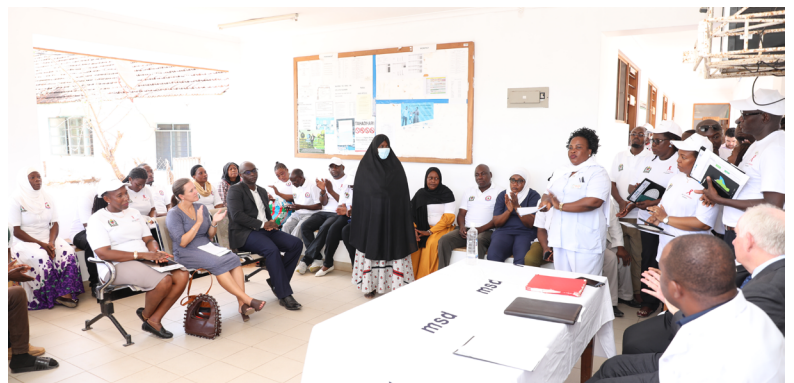
US Ambassador when he was listening to the USAID Afya Yangu Southern service providers and beneficiaries' testimonies at the Sokoine Referral Hospital