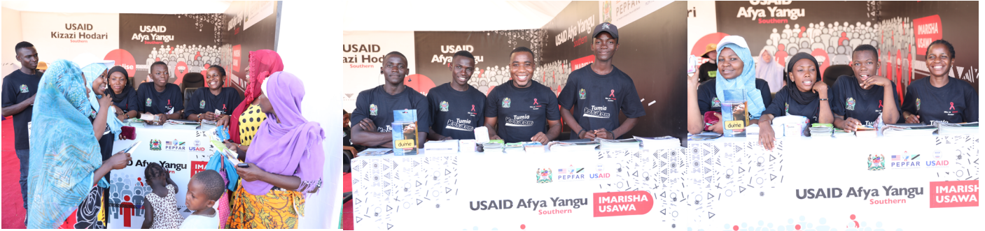
The USAID Afya Yangu Southern Program beneficiaries under the SITETEREKI platform at the booth providing education and information during the WAD 2022 in Lindi

USAID Afya Yangu and Kizazi Hodari Southern programs collaborated with TACAIDS on WAD 2022 commemoration by ensuring full participation and engagement of young people in youth and community