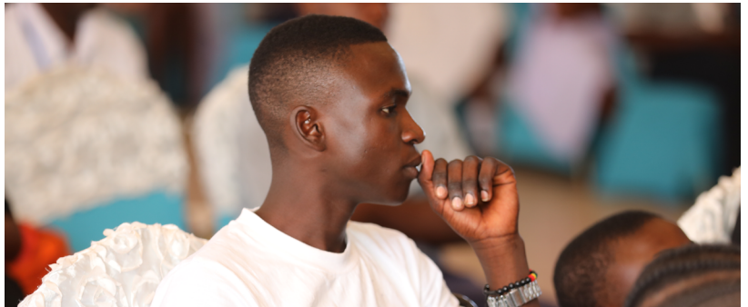
Youth beneficiaries under the USAID Afya Yangu Southern SITETEREKI platform participated in different dialogues at the WAD 2022 and shared youth lessons from the program