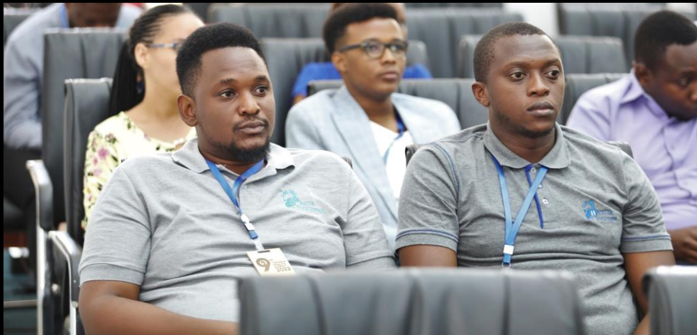
Other Delegates and Forum Participants