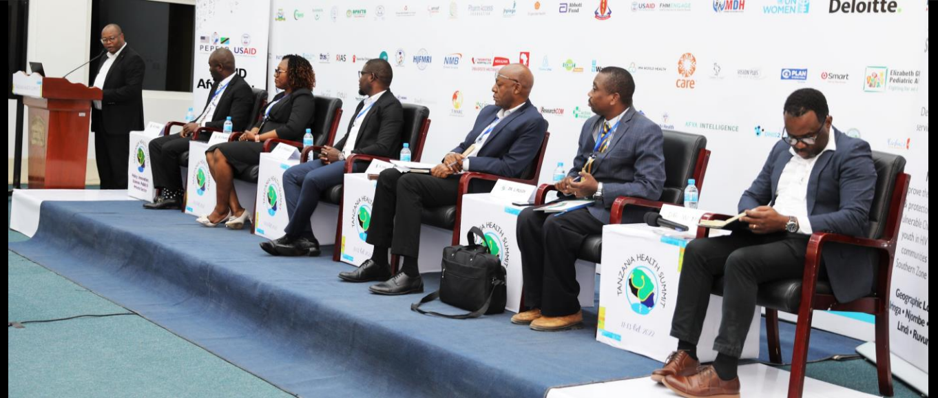
Panelists Discussing Success, Best Practices and Lessons Leant In Differentiated Client Centered Approaches