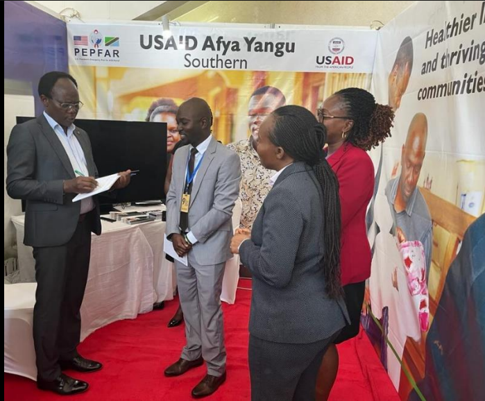
The Guest of Honor: Dr. Godwin O. Mollel, Deputy Minister – Ministry of Health.