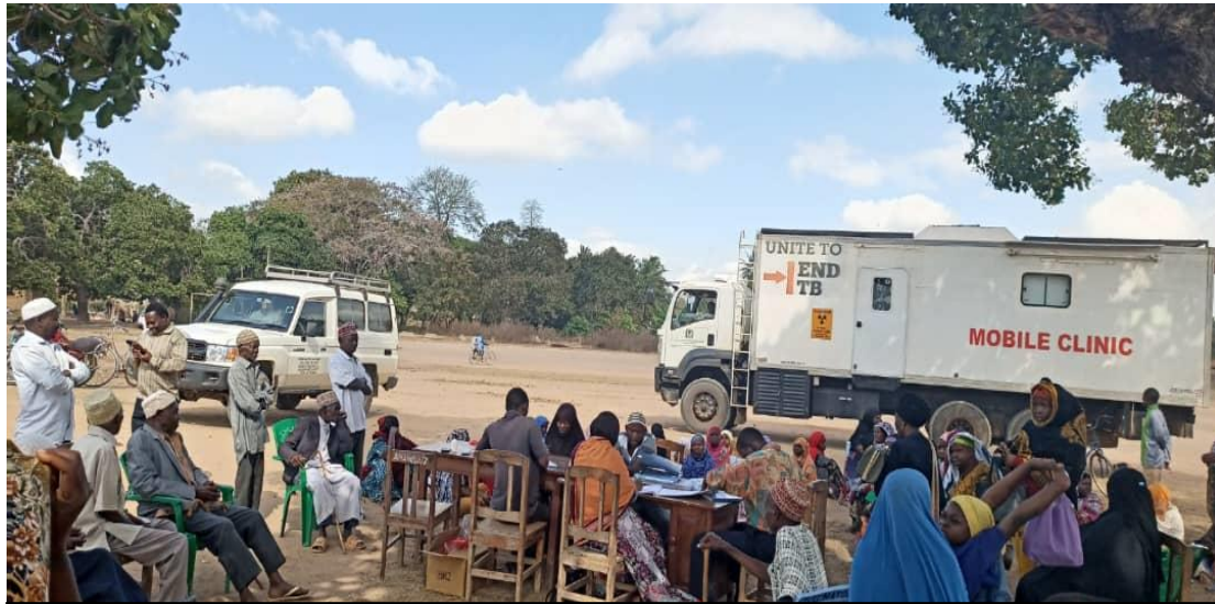
Community sensitization, TB screening and diagnosis using the mobile van