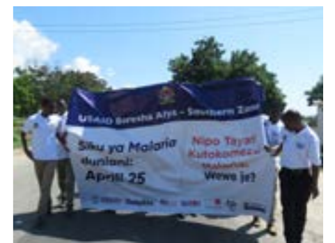
Kilwa Masoko Area, Kilwa District, Lindi – Program staff hold up a banner during the commemorations of World Malaria Day in Lindi.