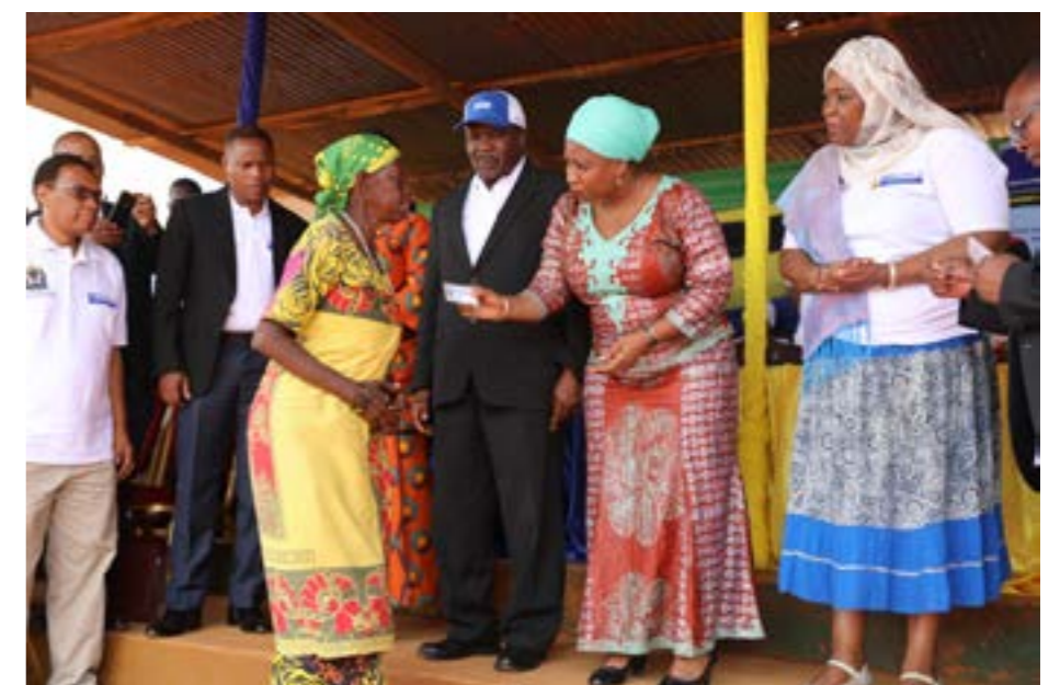
Umoja Grounds, Kasulu District, Kigoma – The Guest of Honour, Hon. Umyy Mwalimu hands a health insurance card to a senior citizen.