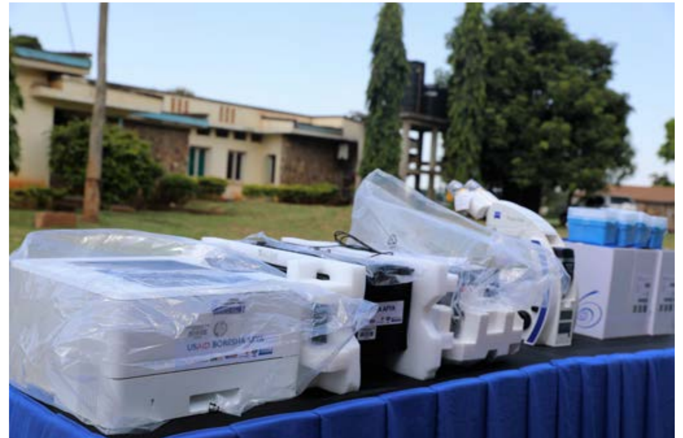
Saba Saba Health Centre, Morogoro – Some of the donated items included microscopes, weighing scales, medicines, desktop computers, laptops, printers, modems and various other IT equipment.

The United States Agency for International Development (USAID) has been a long-standing partner to the people and Government of Tanzania. In 2017 alone, through the USAID Boresha Afya Southern Zone program, USAID has spent TZS 47.2 billion (US$ 20,996,370) on health care.