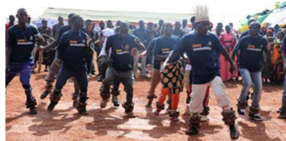
Umoja Grounds, Kasulu District, Kigoma – Kasulu Theatre Arts Group performs during the commemorations of World Malaria Day.