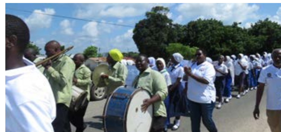
Kilwa Masoko Area, Kilwa District, Lindi – Brass Band leads march from Kilwa Masoko Fire Station to Benjamin Mkapa Gardens during the commemorations of World Malaria Day in Lindi.