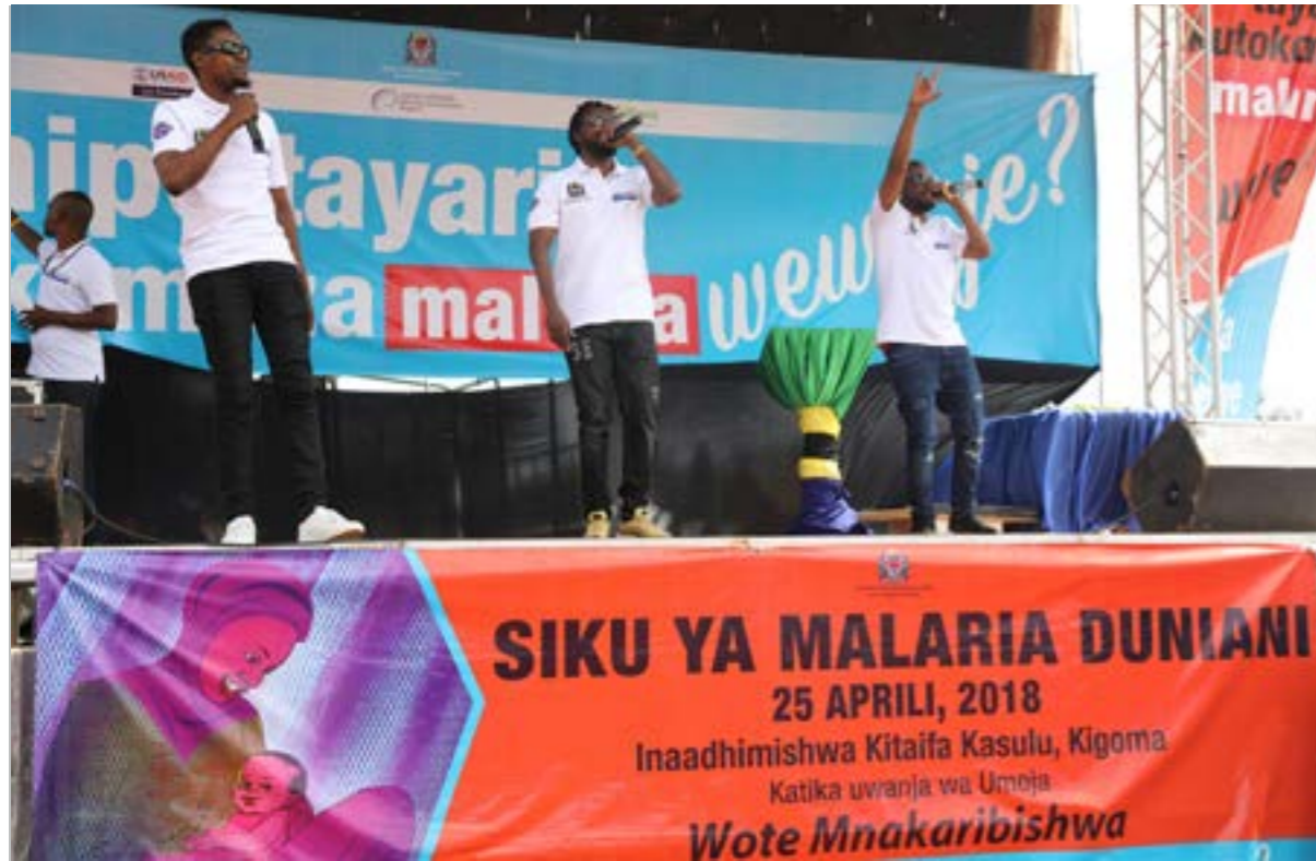
Umoja Grounds, Kasulu District, Kigoma – Vibrant Bongo Flavour Hip Hop Group Weusi perform during the commemorations of World Malaria Day.