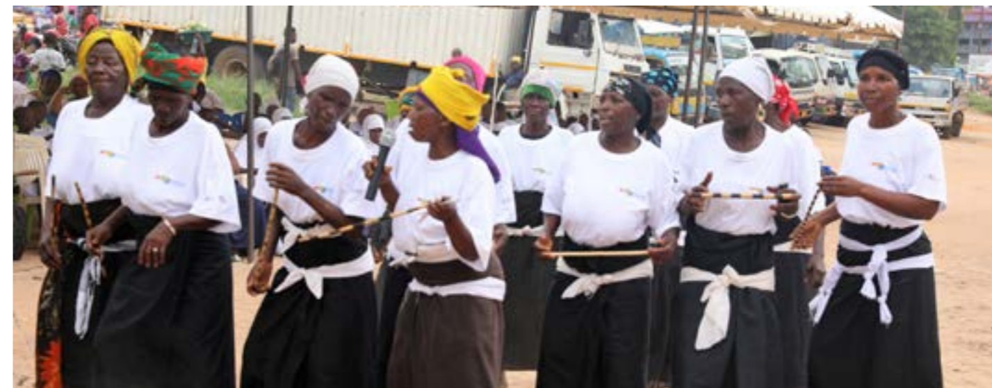
Masasi District, Mtwara – A women's group performs during the World TB Day Commemorations in Mtwara.

The Minister of Health, Community Development, Gender, Elderly and Children (MOHCDGEC), Hon. Ummu Mwalimu stated recently that the Government through her Ministry has set aside 5 Billion Tanzanian Shillings to purchase GeneXpert machines which will be used in TB case detection across several health facilities countrywide.