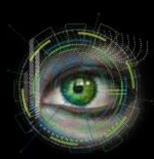
Power of With Focus on the power humans have with machines.