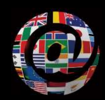
Tax@hand Latest global and regional tax news, information, and resources