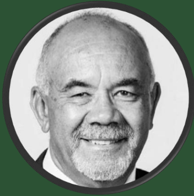
Te Ururoa Flavell Cultural Advisor & Consultant

Proven leader and educator. Te Ururoa has served New Zealand in the roles of Minister in NZ Government, Co-Leader of the Māori Party and Member of Parliament for Waiariki.