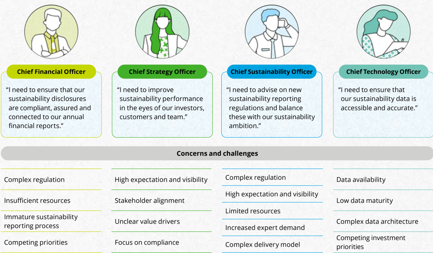
Figure 2. Sustainability reporting stakeholders have different needs

For many organisations General Counsel and Chief Risk Officers are also involved, with additional considerations