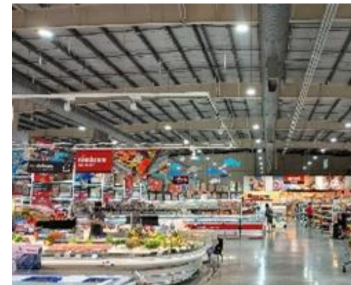
▲ [Example of commercial facilities]

2026–2028: Sensor installation at target stores / AI learning using collected data 2029, March: This project ends 2029, April~ : Planned deployment as an AI energy-saving model for commercial facilities in Thailand and other ASEAN countries. Target: Commercial facilities owned by CP Group(CP Axtra)