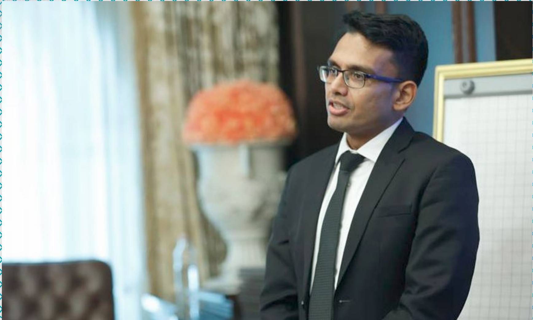
Managing the Energy Transition through a period of Surging Peak Demand