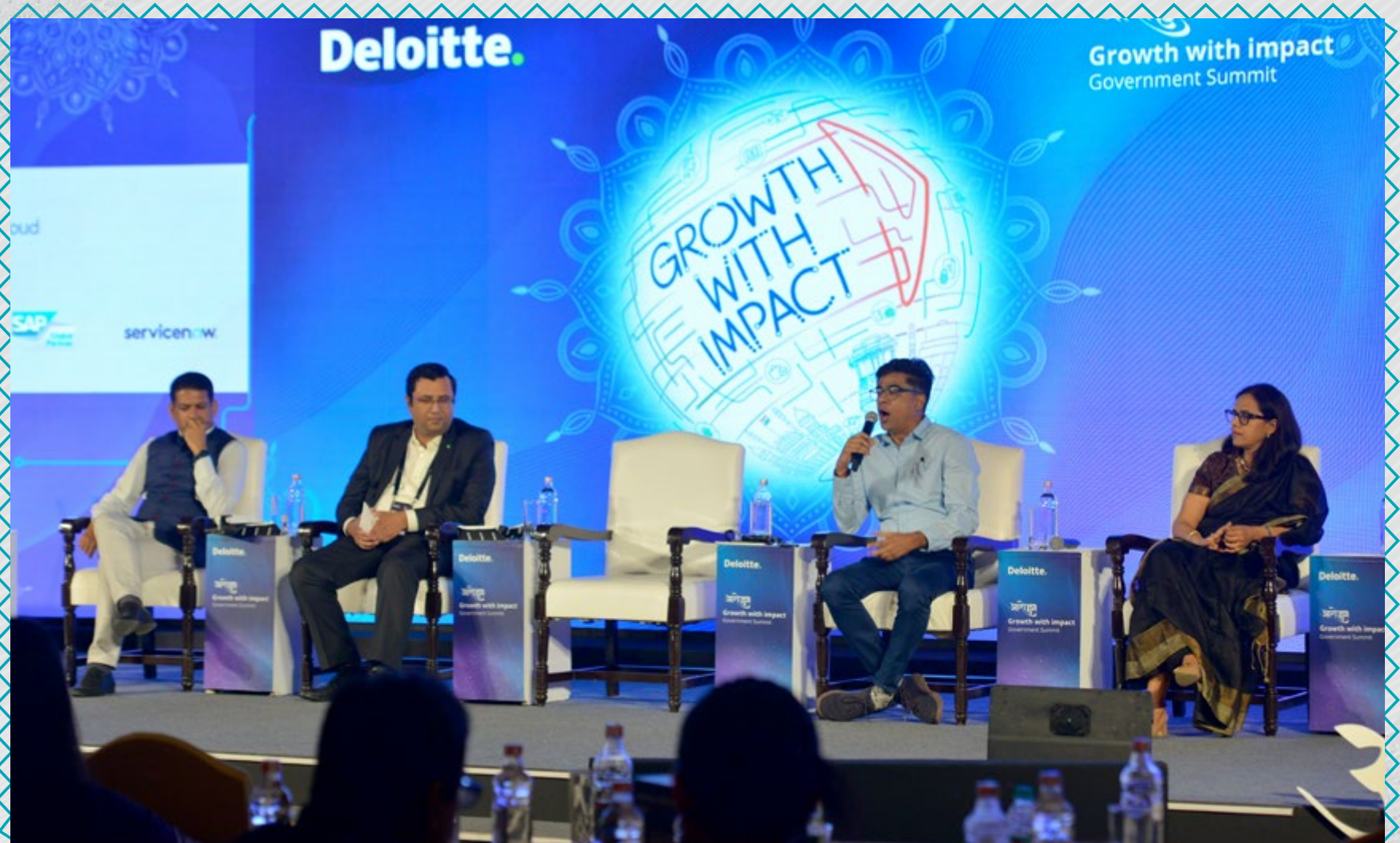
Power Bytes: Driving DPGs as a National Agenda