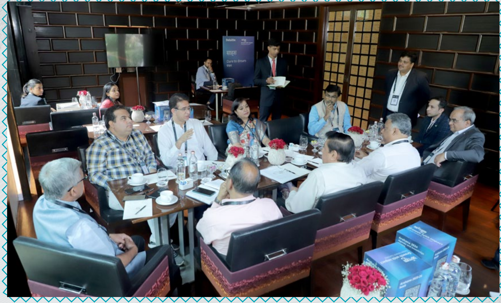
■ Digital Cooperatives