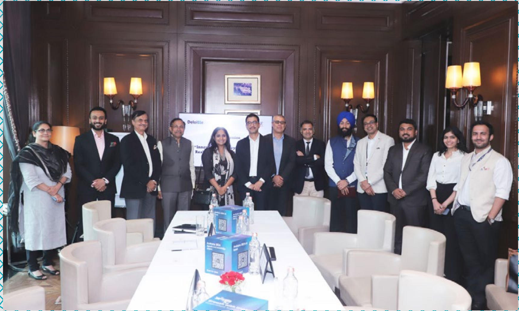
Innovation in Policymaking to Realise the Vision of India @ 2047