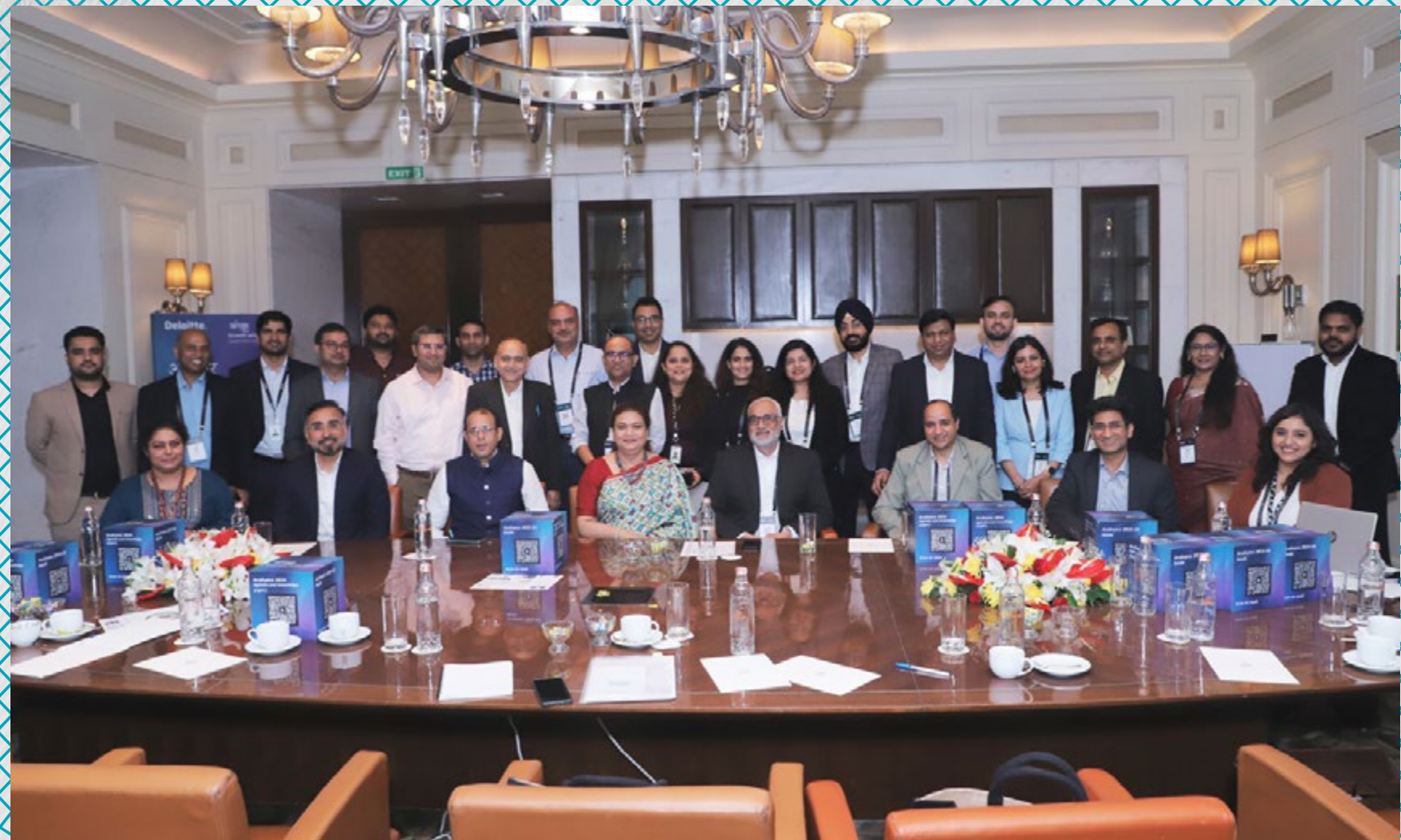
ABDM for providers