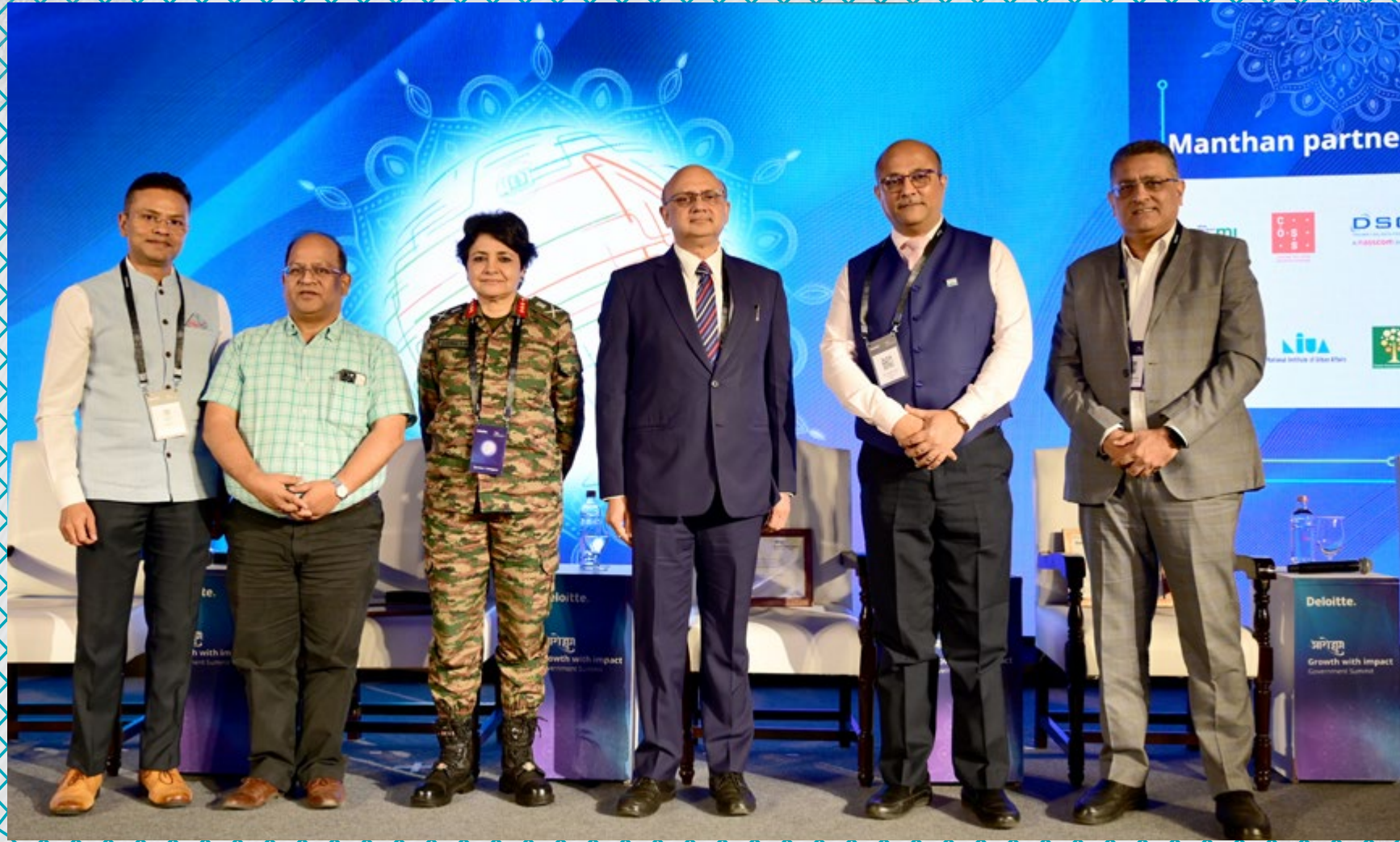
Power of Digital in Creating Experience and Organisational Efficiency