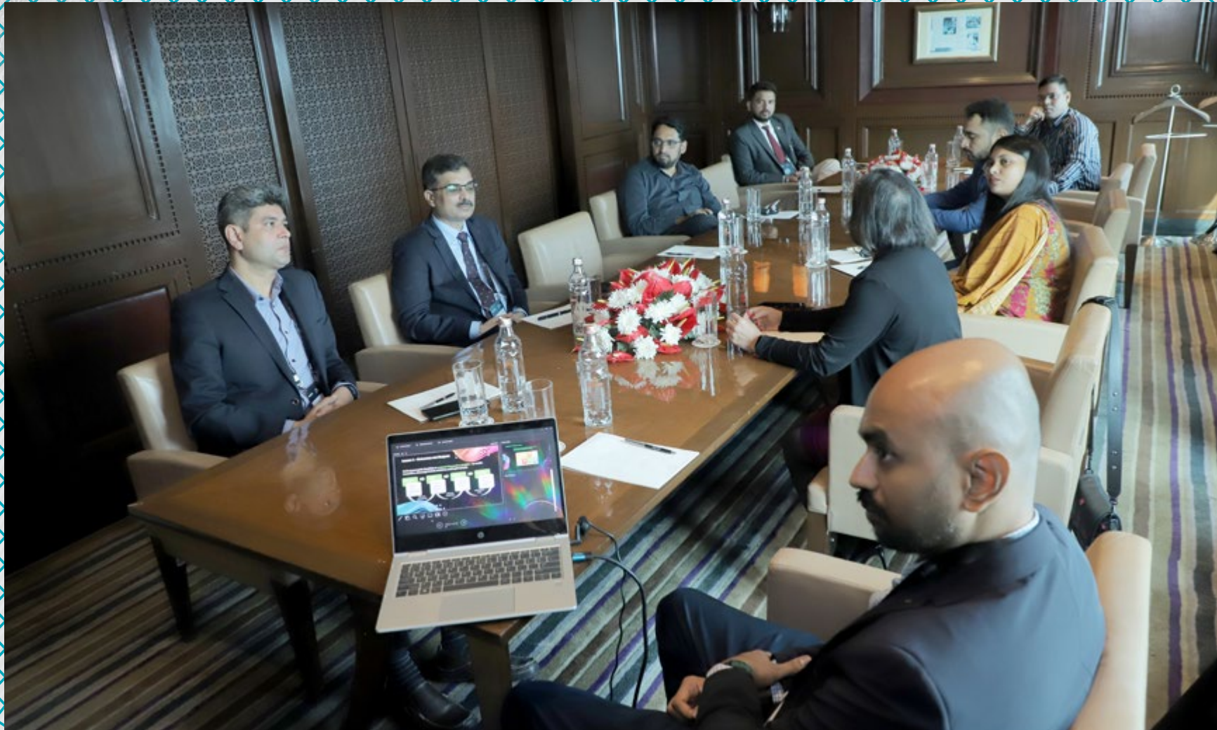
Measuring the Immeasurable