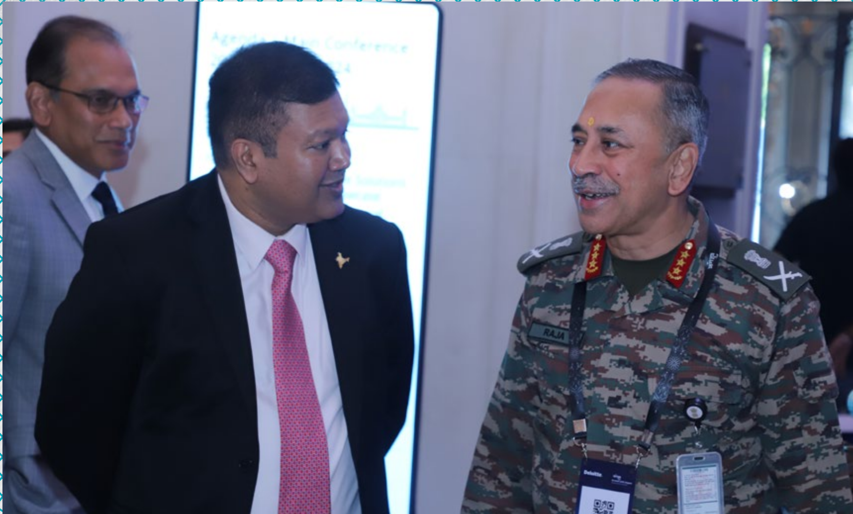
Leaders Speak: Building a Secure Bharat, A Viksit Bharat