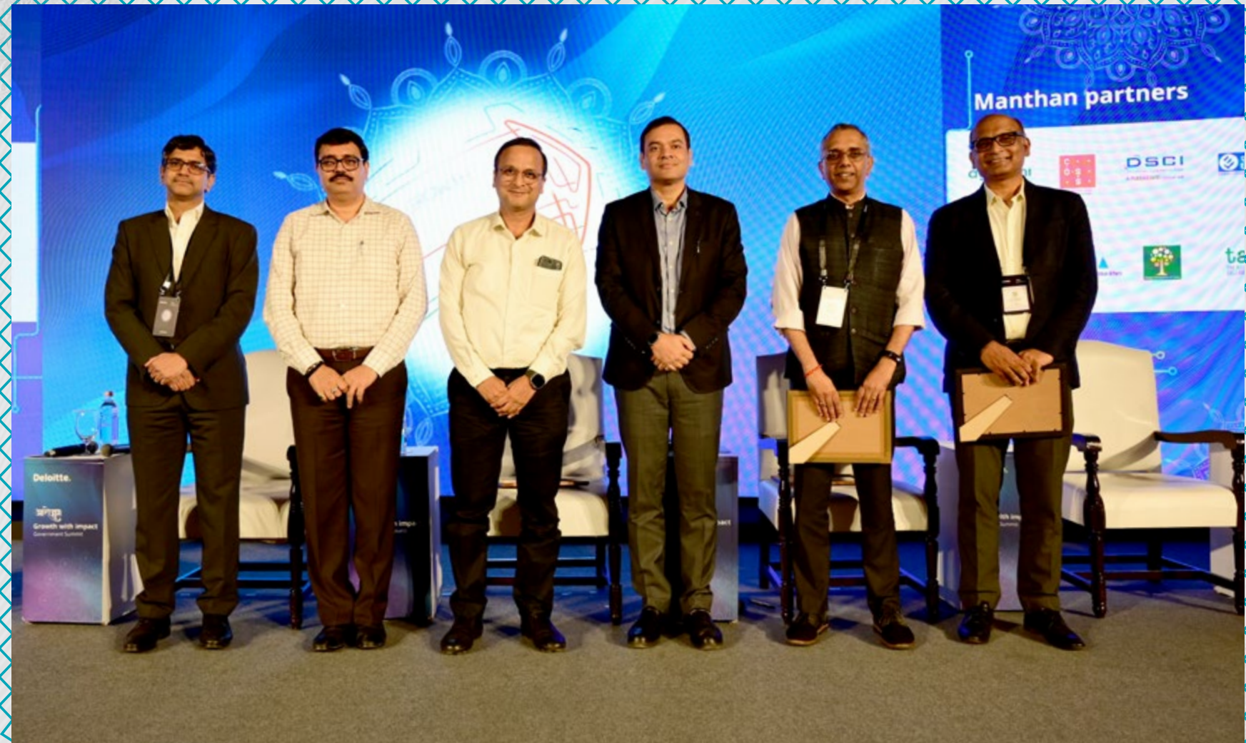
Tech4Good: Building for Bharat