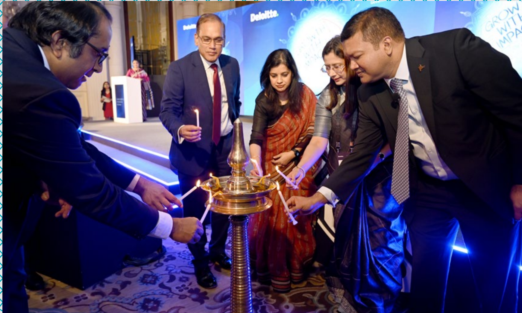
Lamp lighting and National Anthem