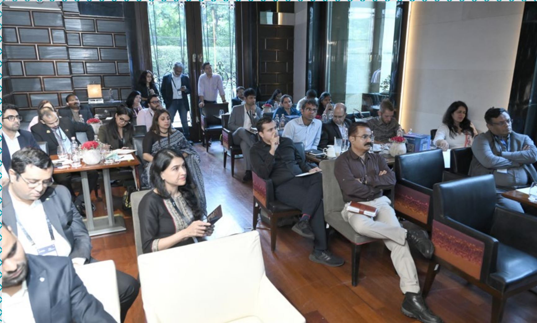
Open AgriNet and VISTAAR