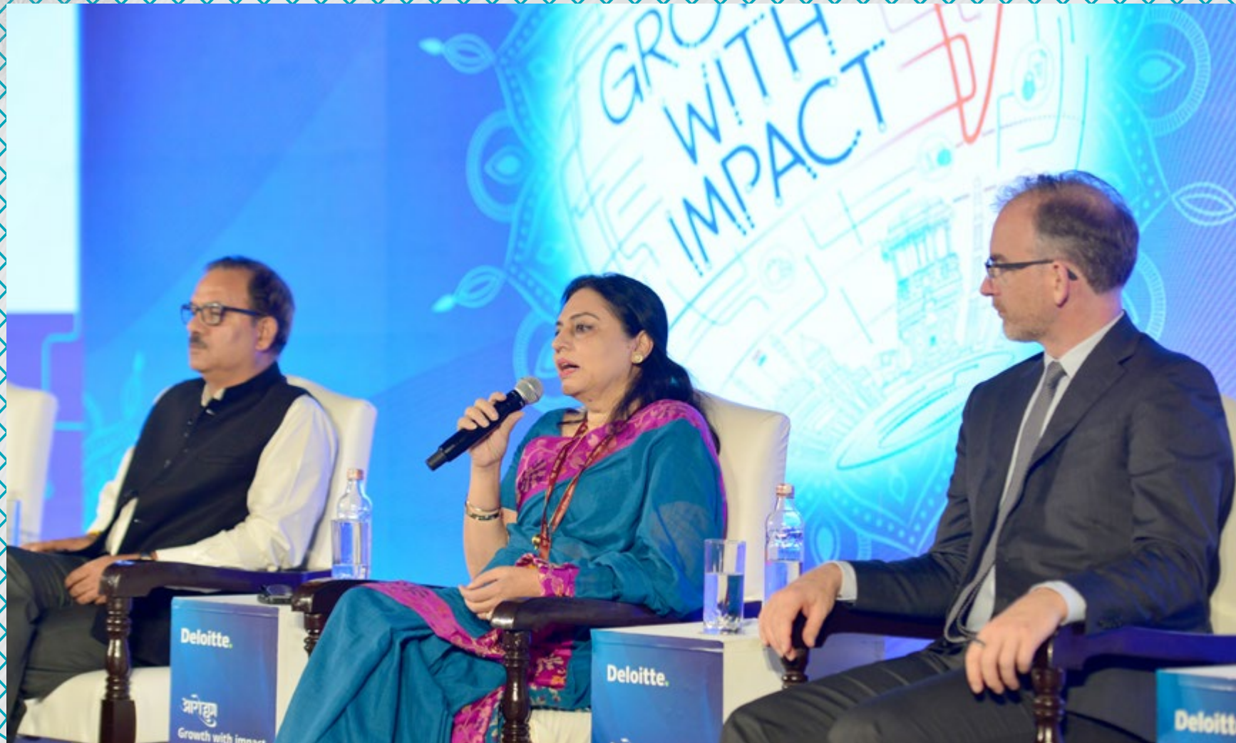
Green Growth - Technologies for Energy Innovation and Climate Resilience