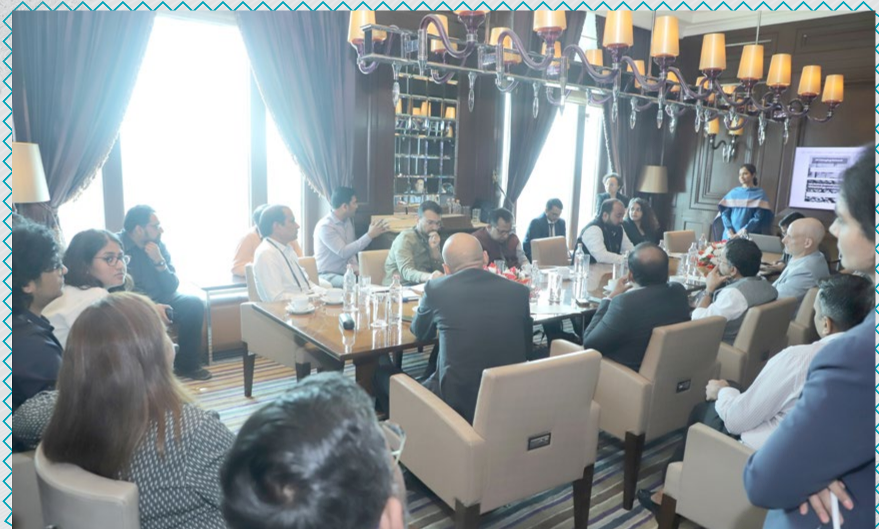
Unified Energy Interface