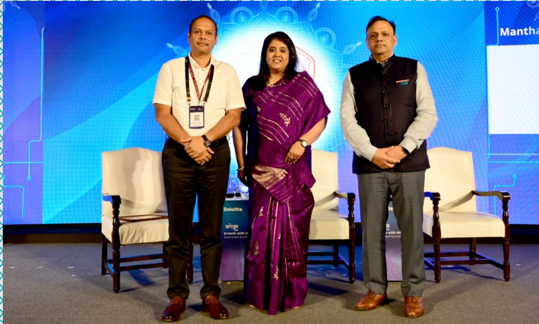
▮ Fireside Chat: Transformative Solutions and Projects Showcase