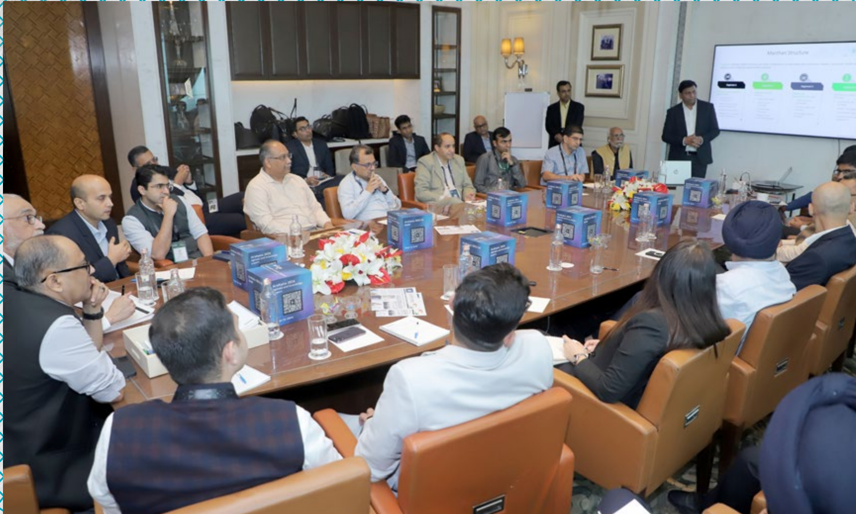
ABDM for HealthTech