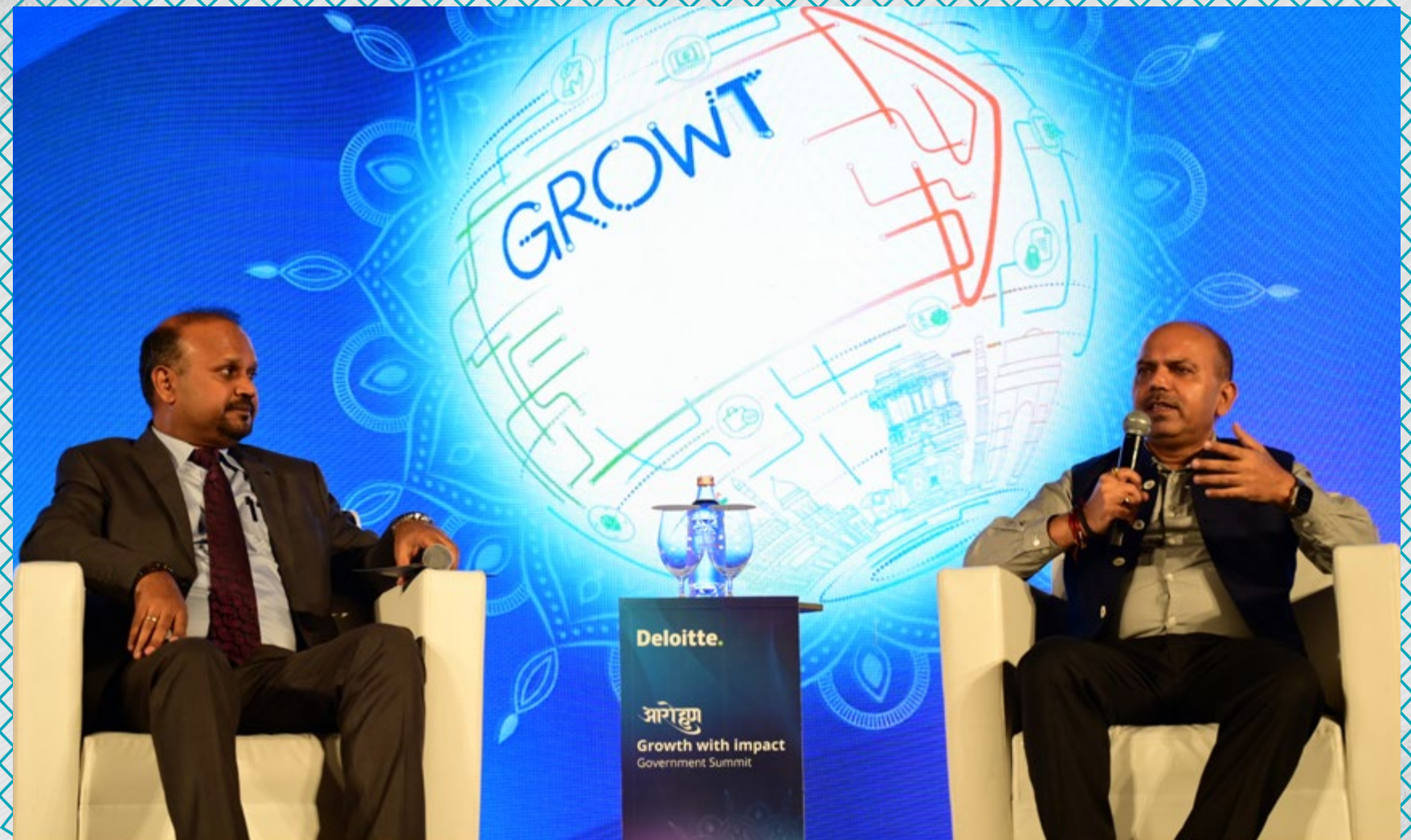
Creating impact in Rural India