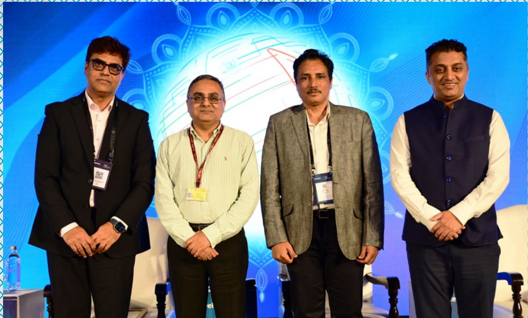
| Sustainable Agri Network: Empowering Agriculture with Sustainable Supply Chains