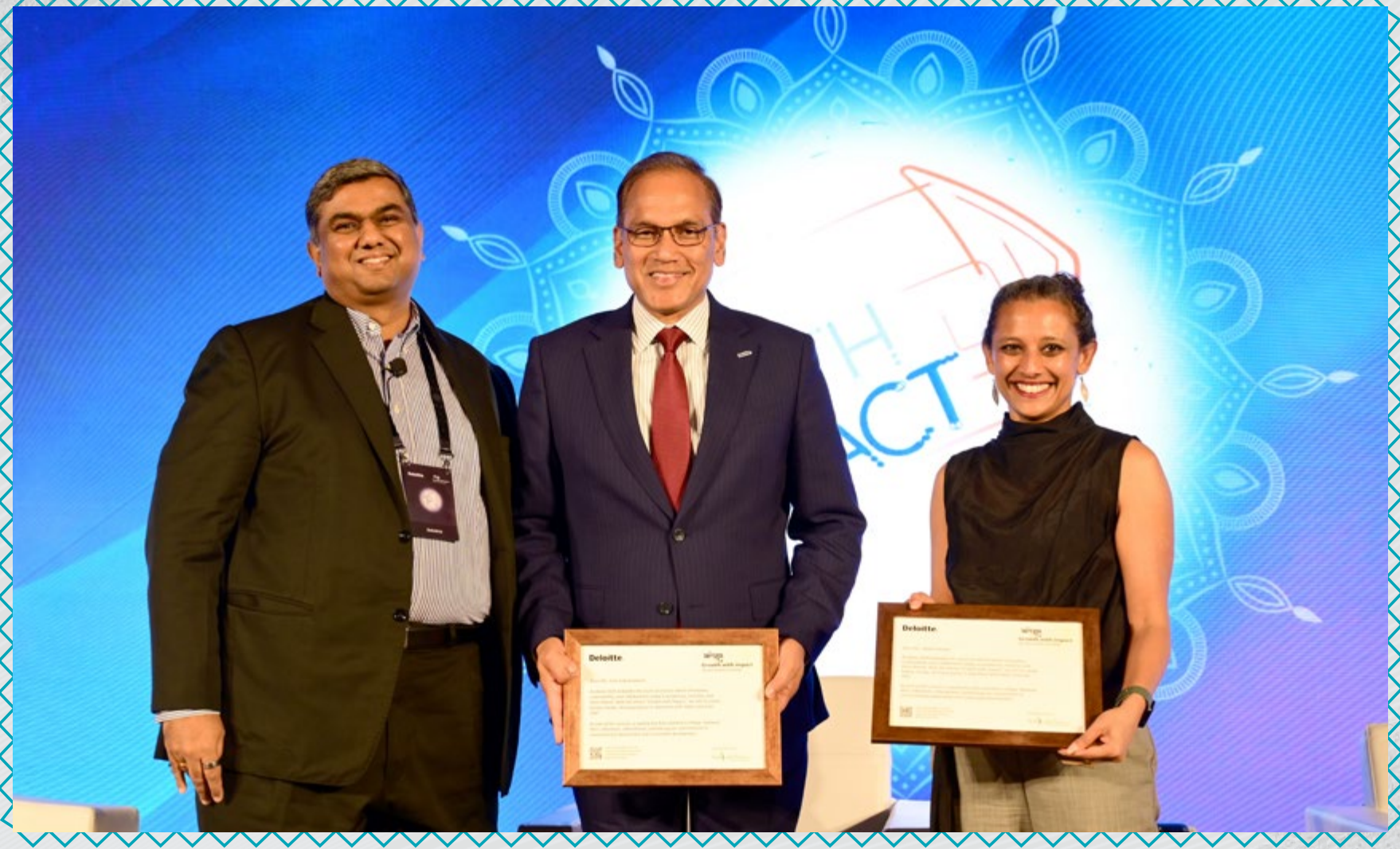
▮ Fireside Chat: Future of Government