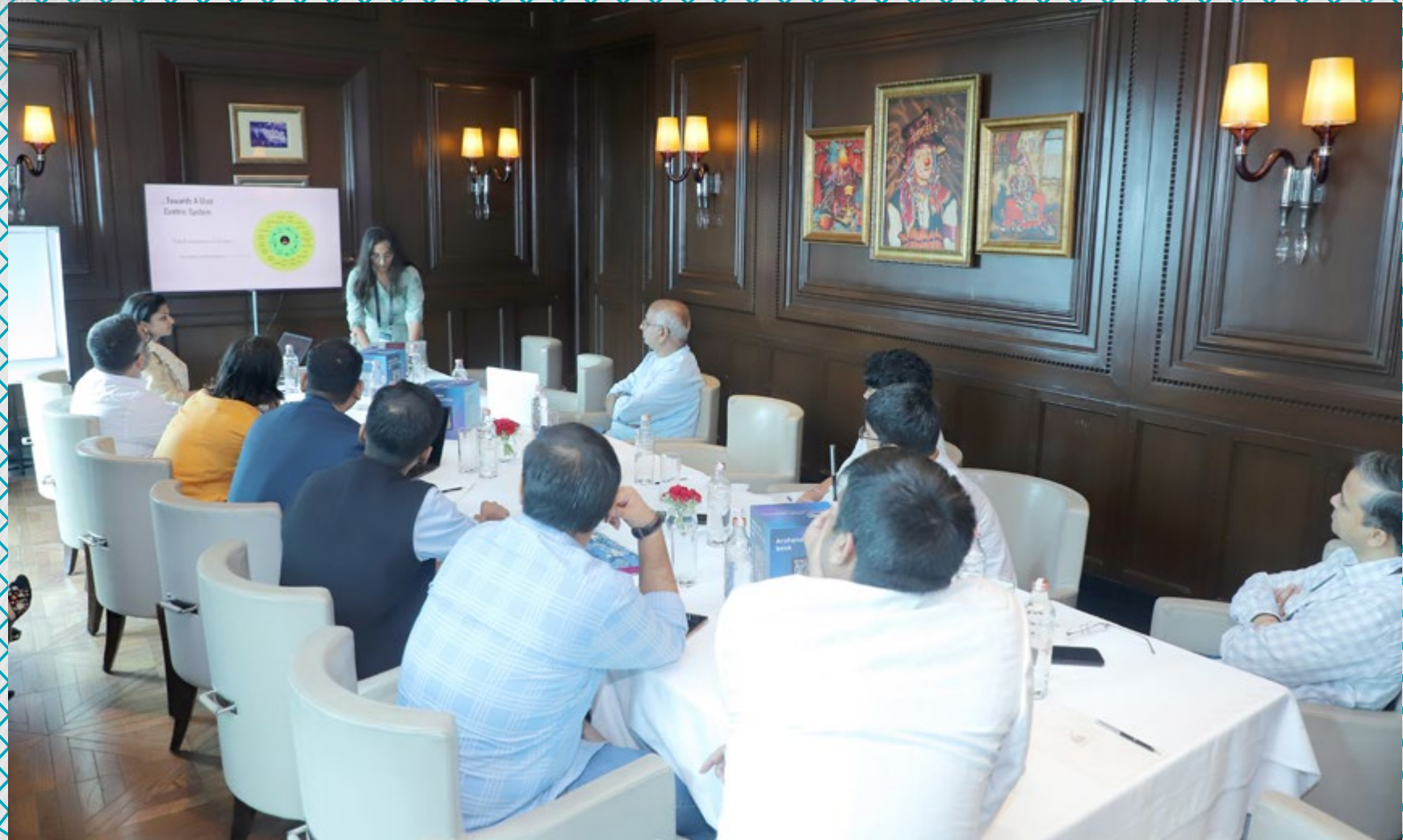
Envisioning a User-centric Justice System