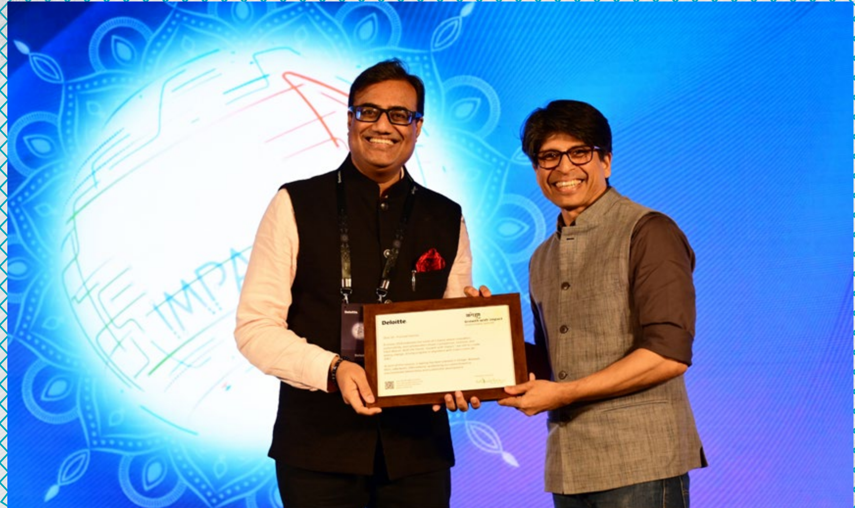
| Talk: Building for Bharat and taking it Global