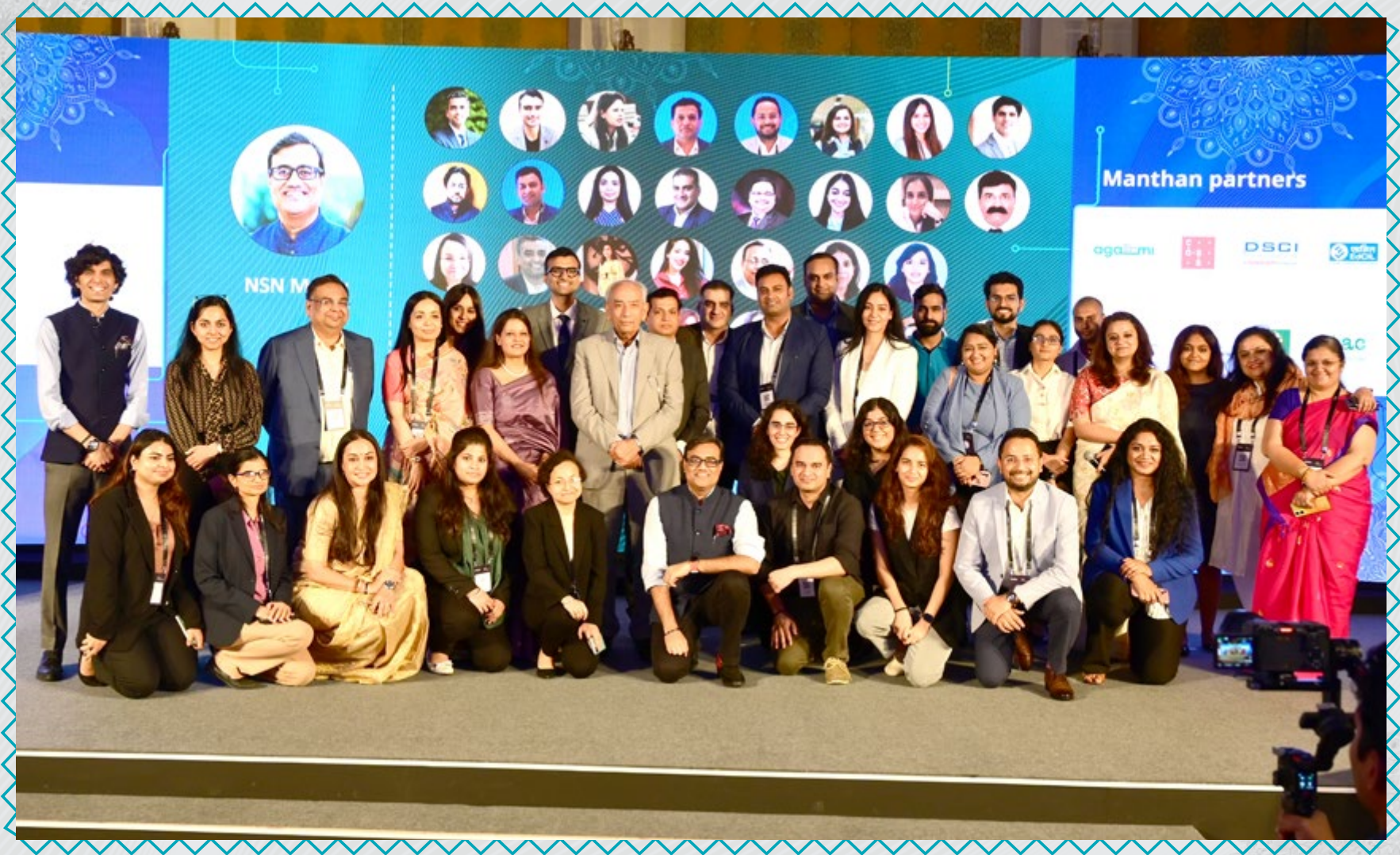
Team Ārohaṇa (आरोहण): Growth with Impact 2024