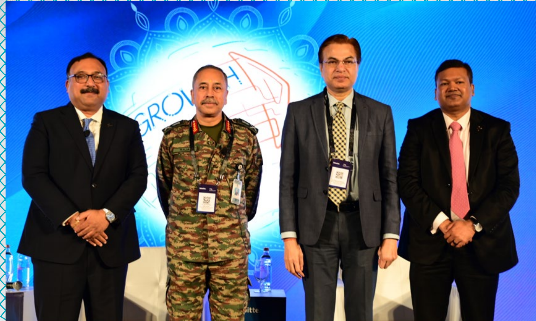
Leaders Speak: Building a Secure Bharat, A Viksit Bharat