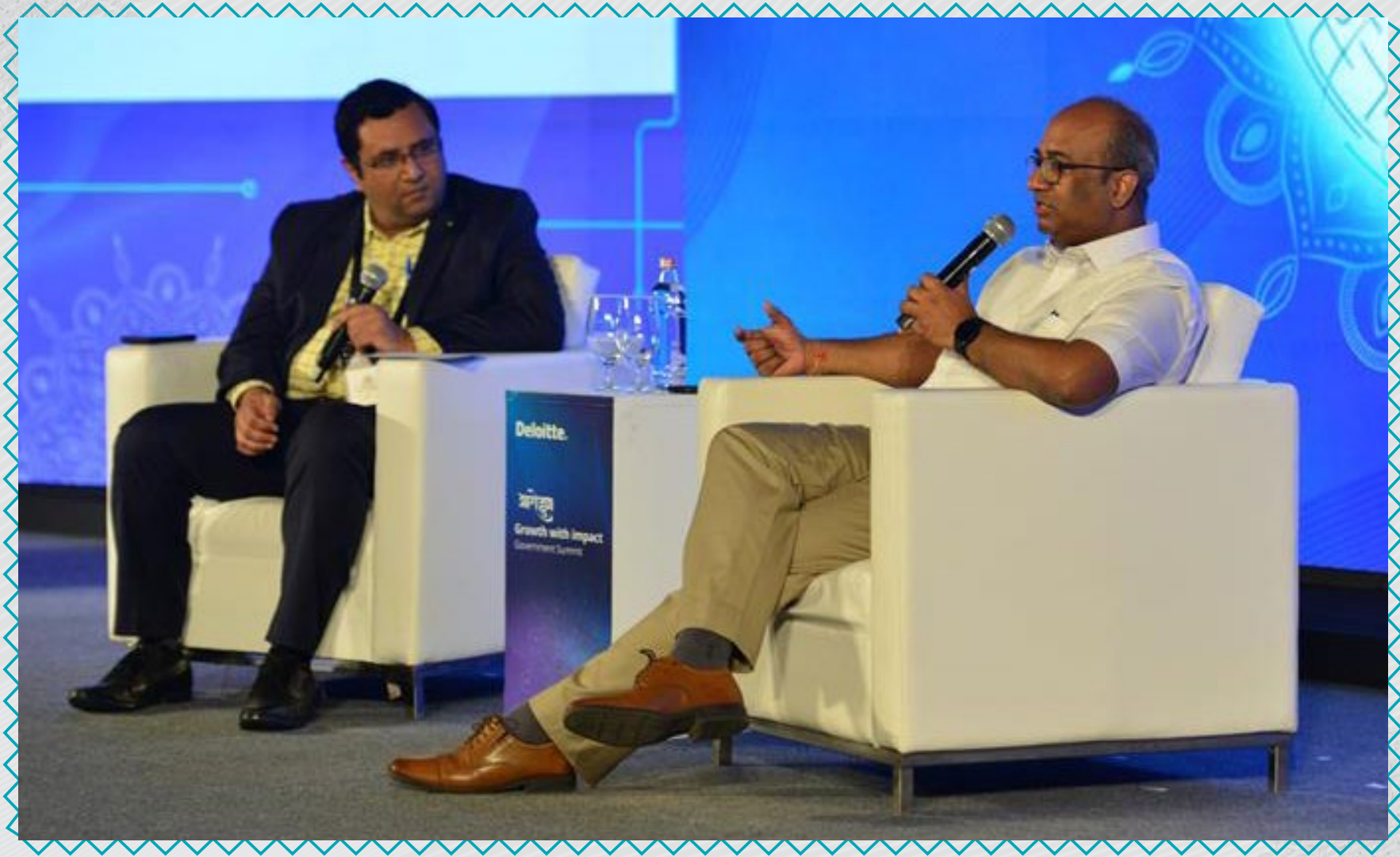
■ Fireside Chat: The Power of GenAI