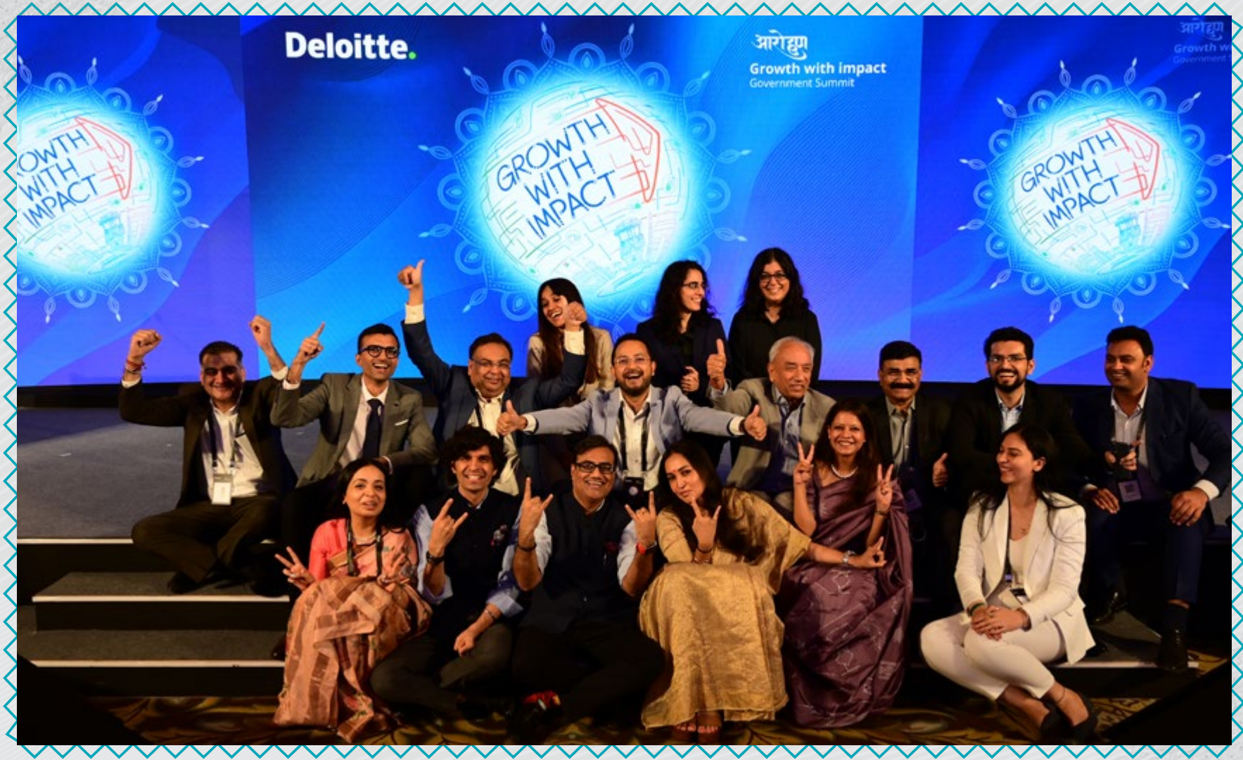
| Team Ārohaṇa (अरोहण): Growth with Impact 2024