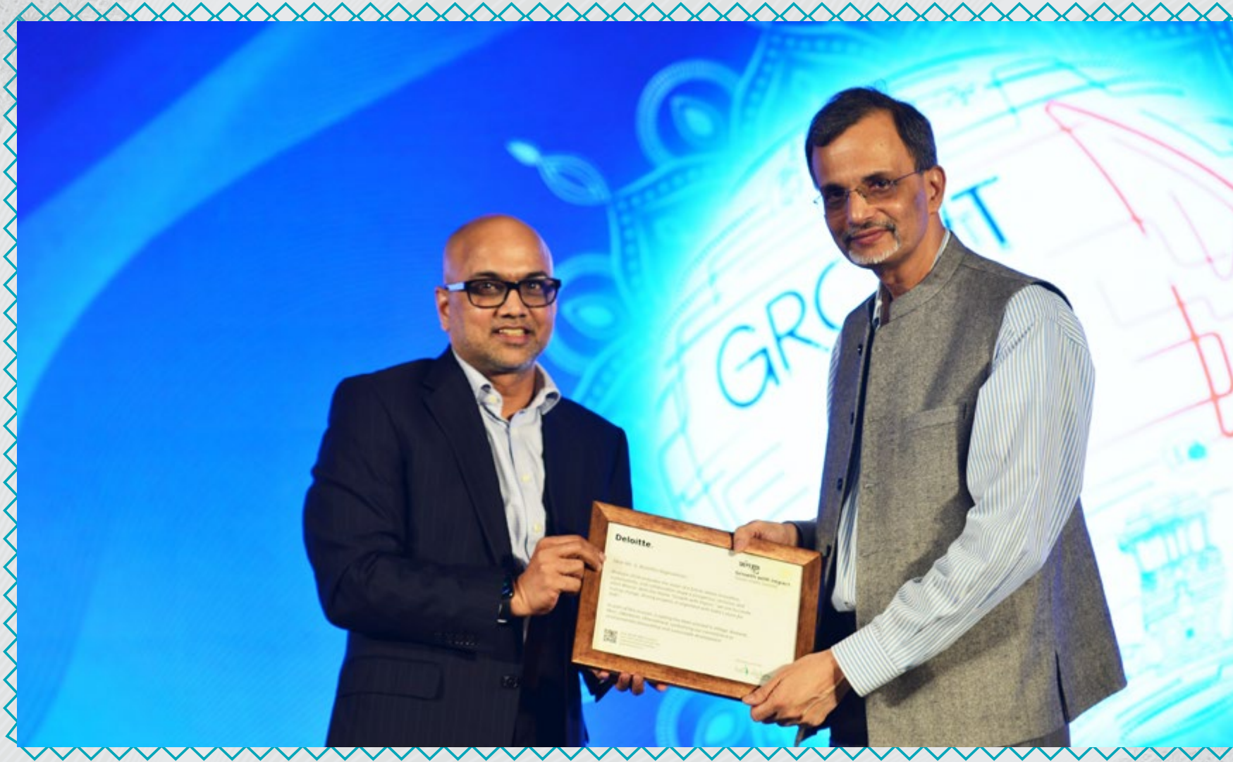
Leaders Speak: Viksit Bharat – Balancing Inclusivity with Growth