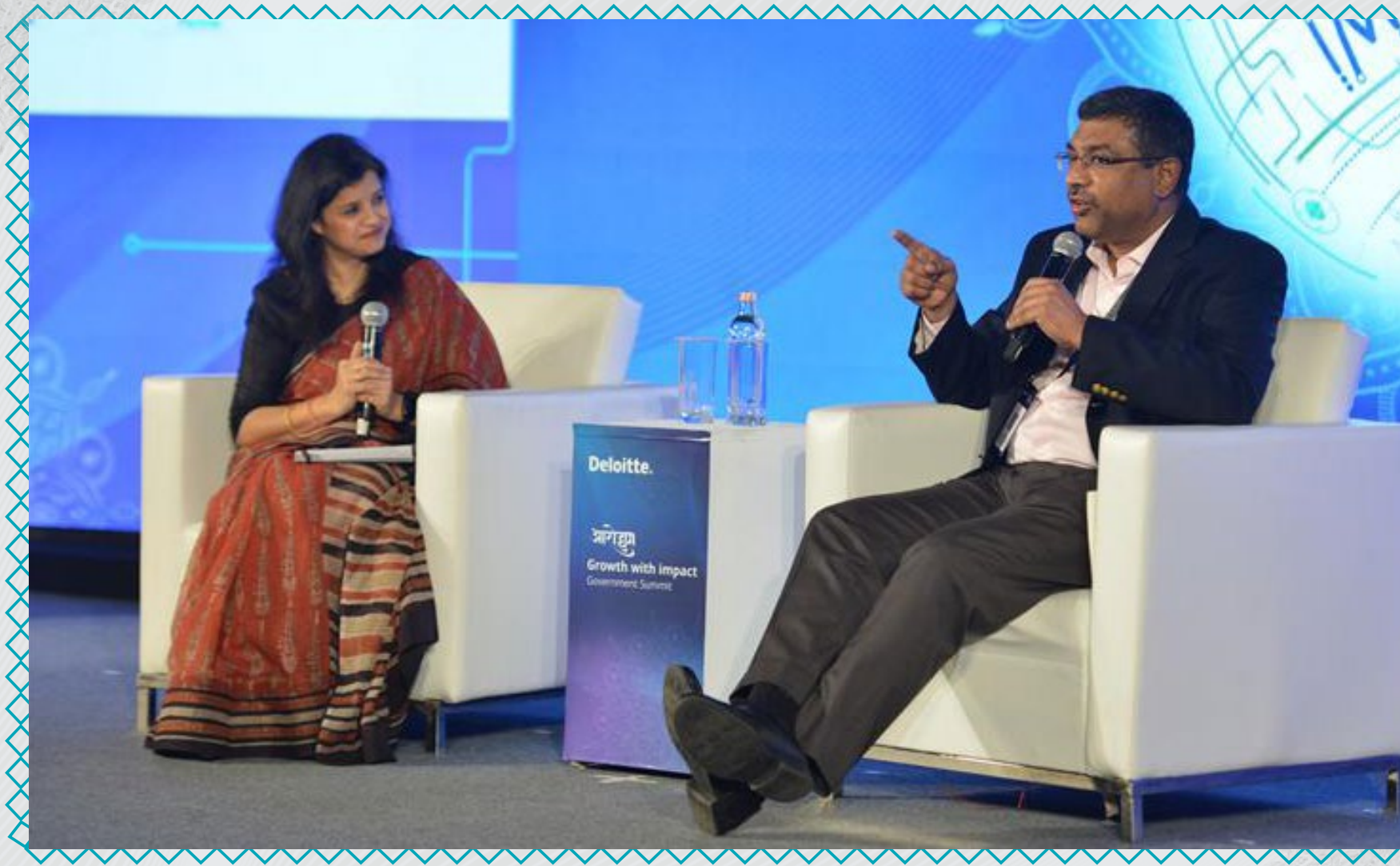
Leaders Speak: Vision for Viksit Bharat