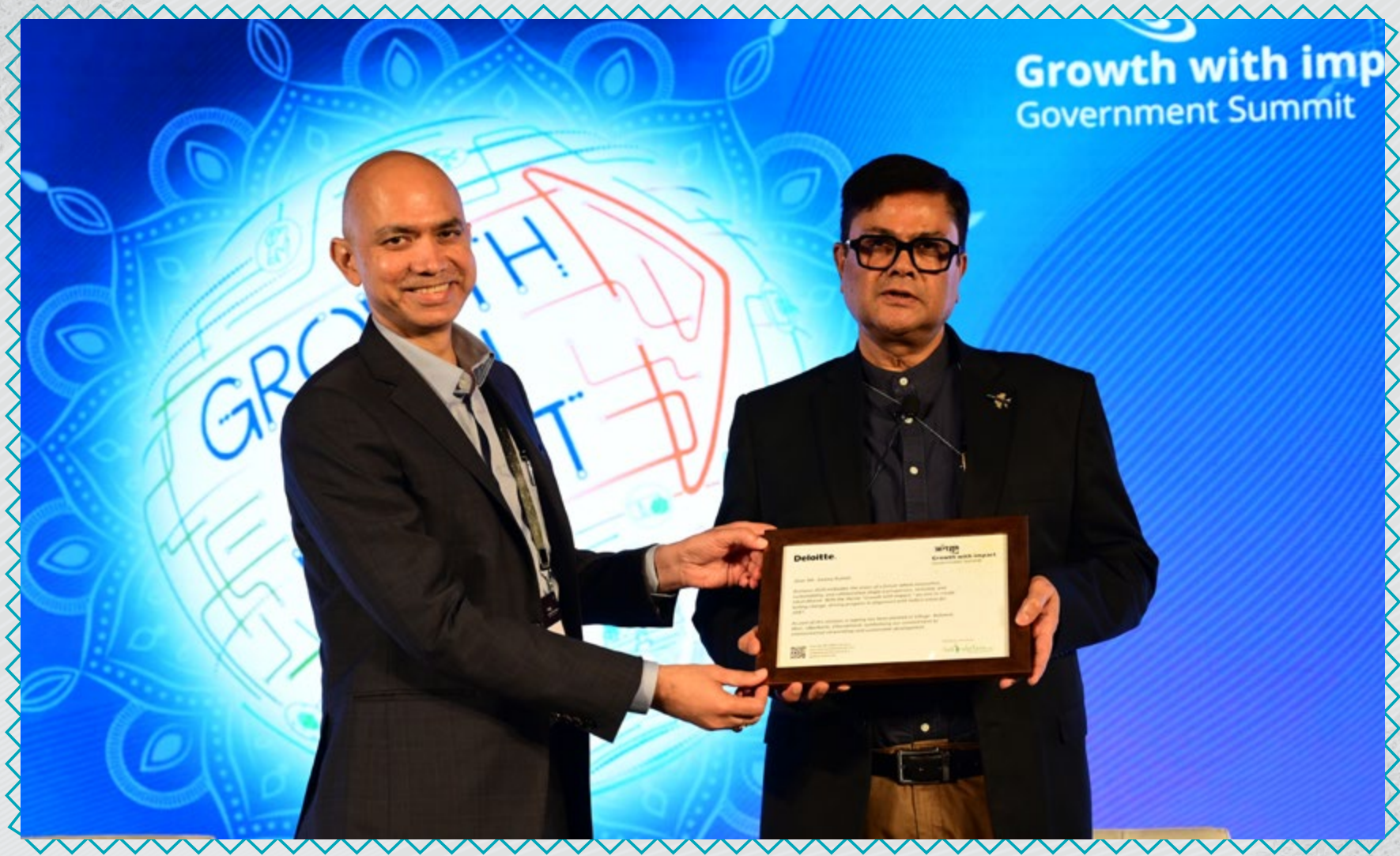
Leaders Speak: Affordable and Accessible Education: Critical Pathways for Advancing Social Inclusion and Equity