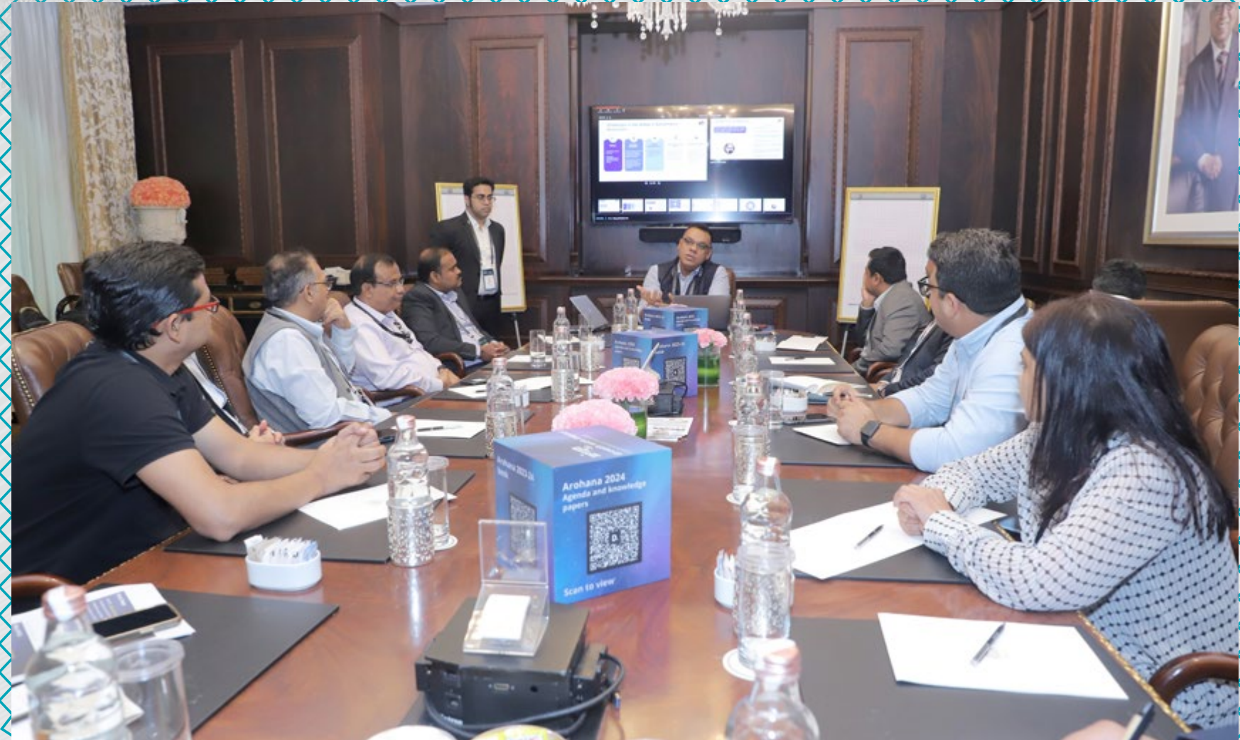
Urban Platform for Delivery of Online Governance (UPYOG)