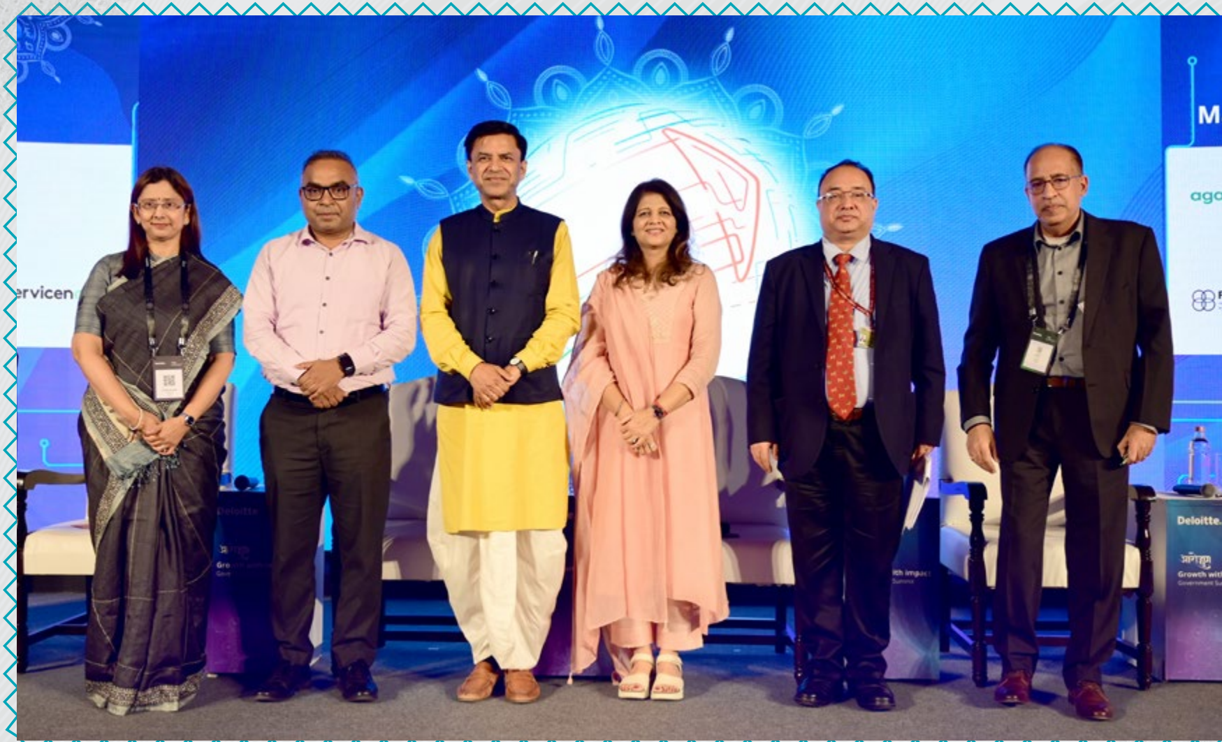
Bringing the Power of Digital to Physical & Social Infrastructure Development