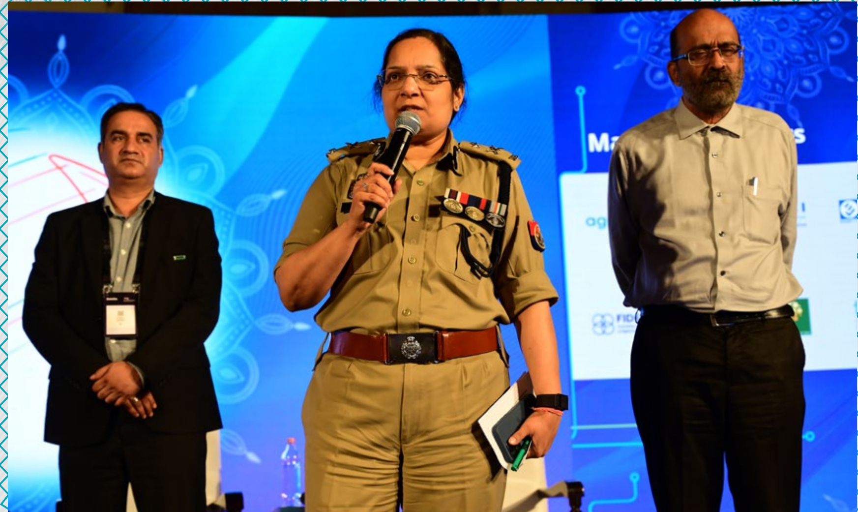
Fortifying Digital Infrastructure – Elevating Cyber Defence for a Secure, Resilient and Vibrant Nation