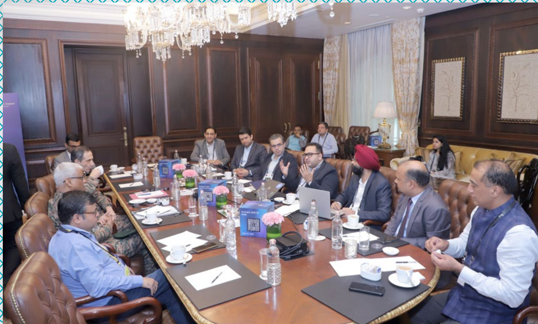
Building Trust with Sovereign Cloud – Policy, Technology and Strategy