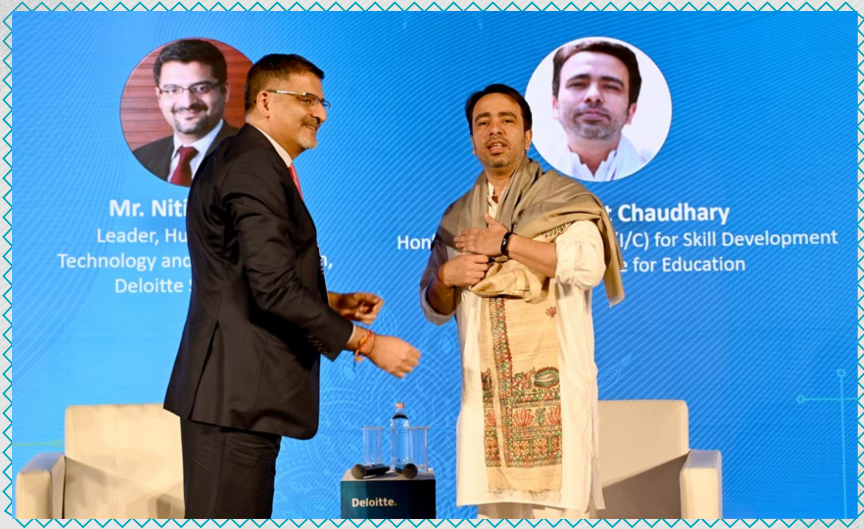
Leaders Speak: Vision for Viksit Bharat