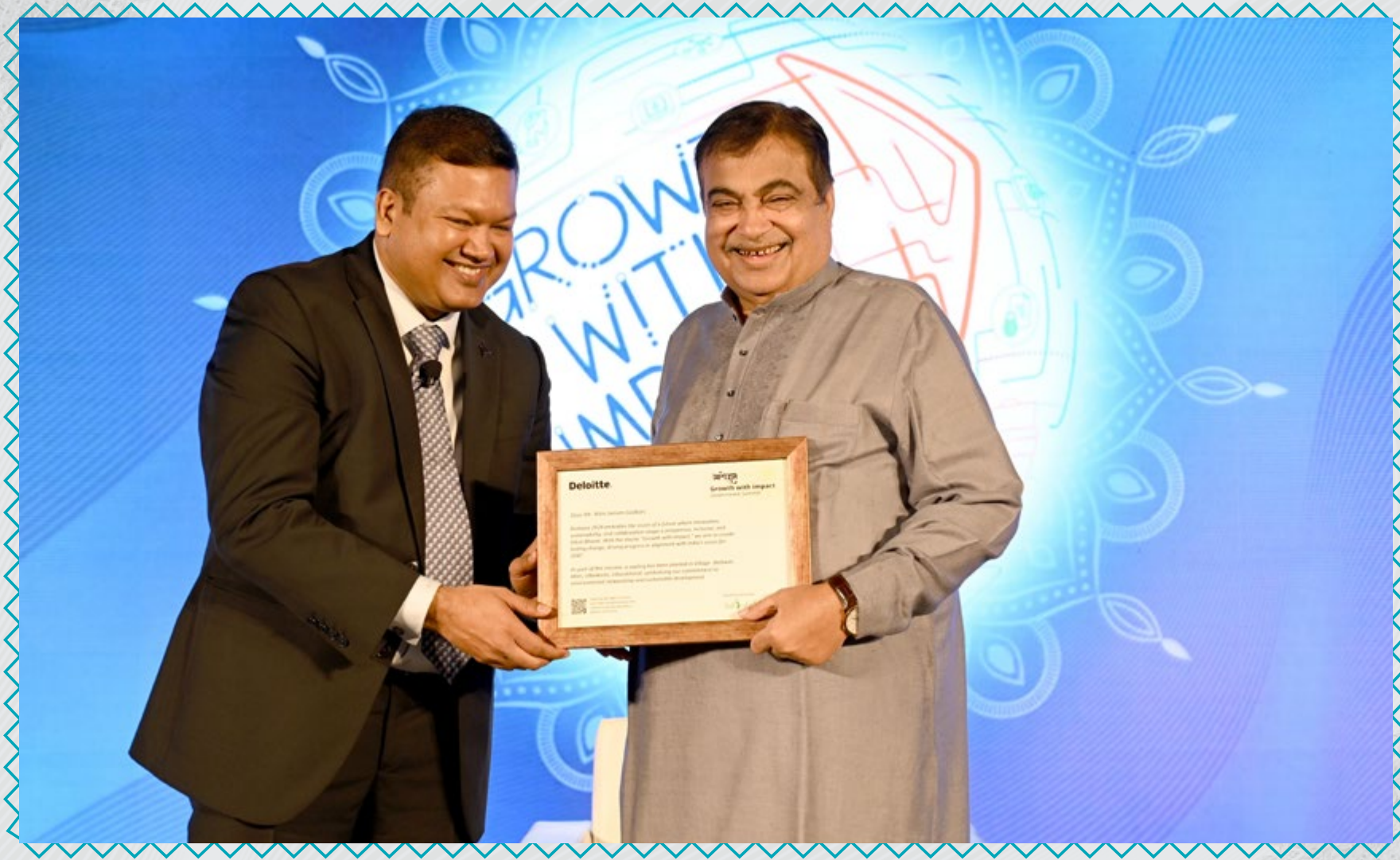
Keynote by Nitin J Gadkari, Minister of Road Transport and Highways, Government of India