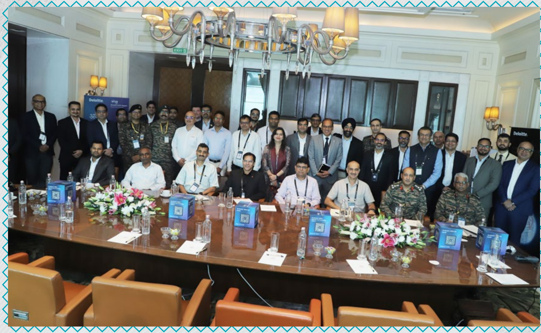
Demystifying Modern SOC's in Hybrid and Hyperconnected Environments