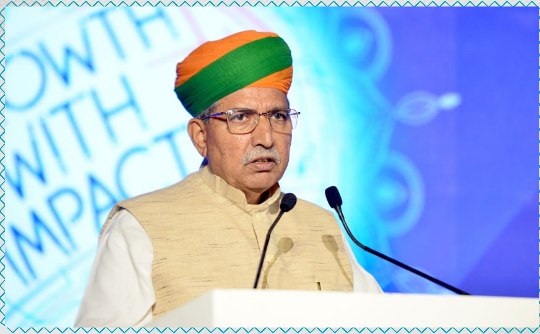
Leaders Speak: Law and Justice – A Transformation Story