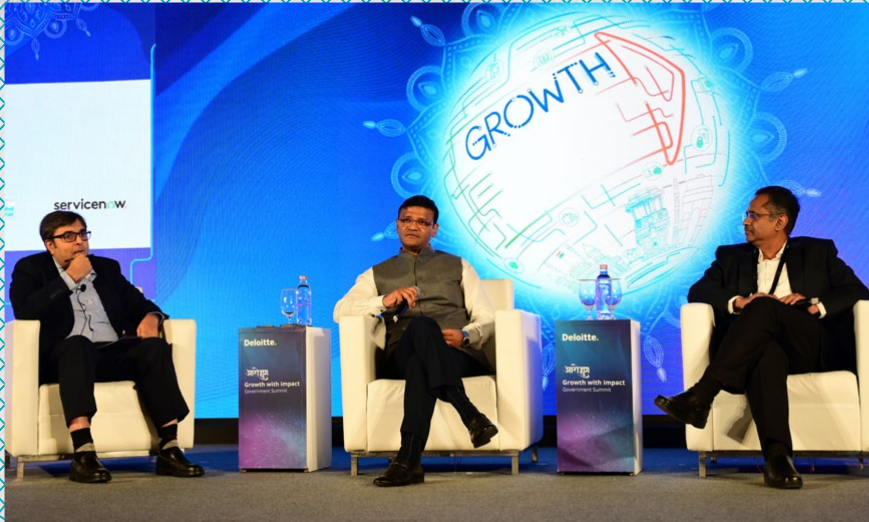
| The Power of GenAI: Driving Service Delivery Efficiencies for Citizens and Businesses