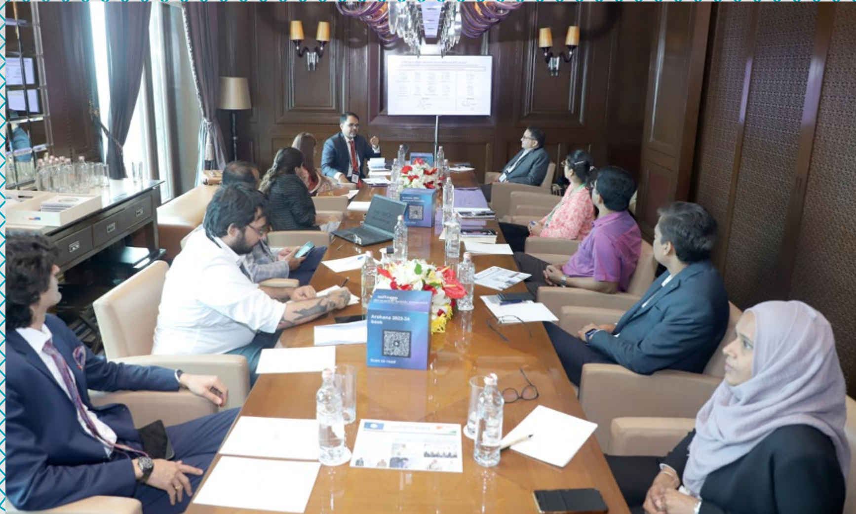
■ Digital Enablement of MSMEs via the ONDC