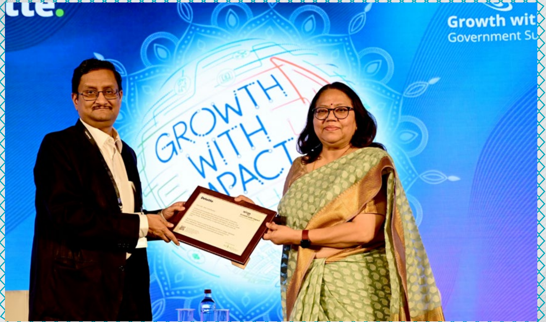
Leaders Speak: Vision for Viksit Bharat