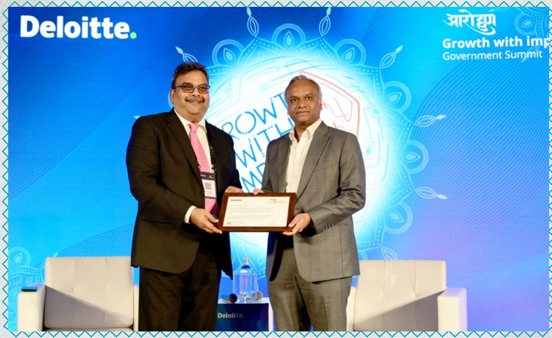
Leaders Speak: Karnataka Growth Story