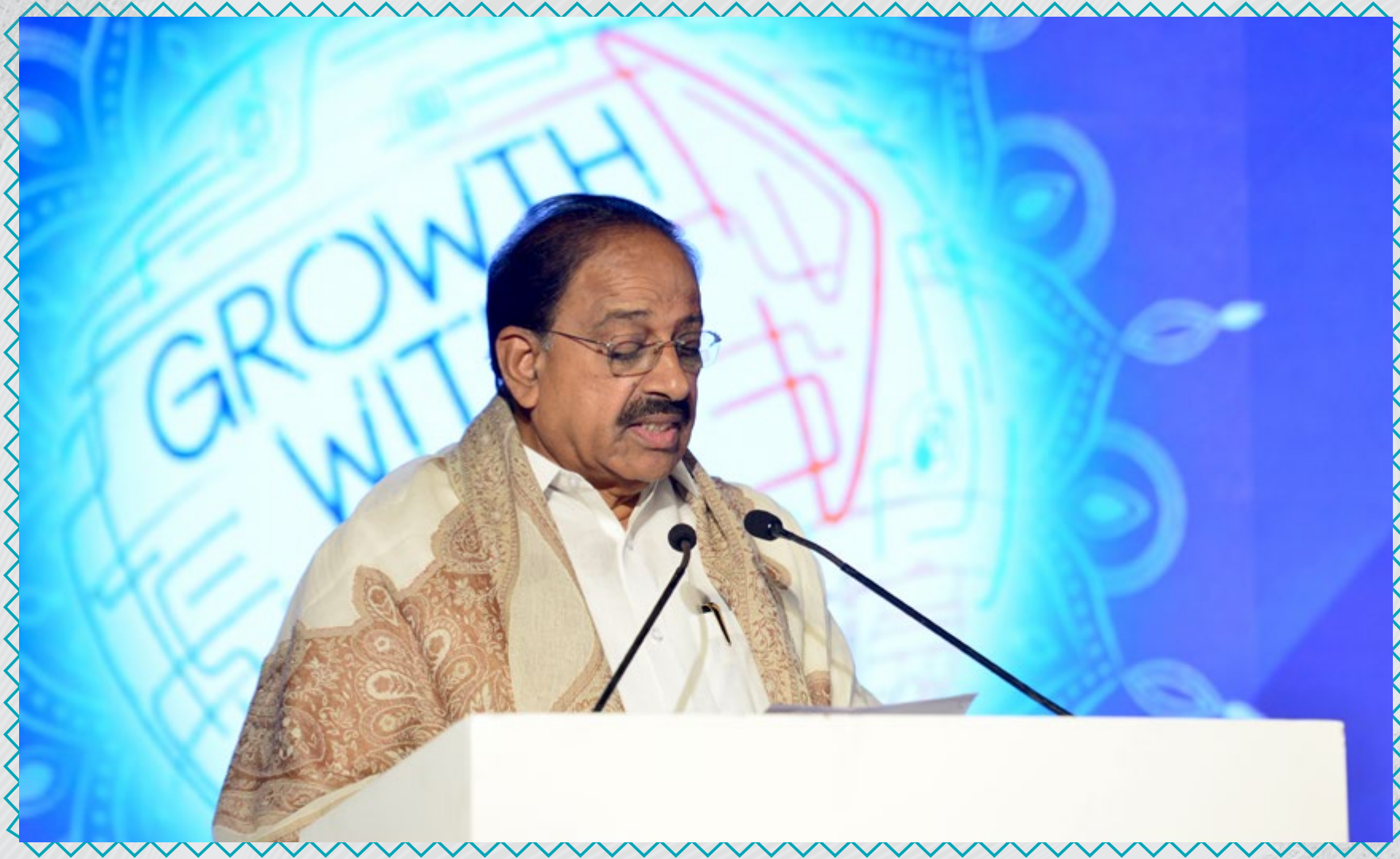
Leaders Speak: Viksit Telangana