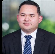
SOTER TIONG PARTNER

+61 2 9322 5103 +61 432 013 107 IPAL@DELOITTE.COM.AU