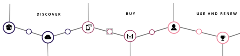
Figure 2. The buyer's journey typically involves three main stages that span from a B2B consumer doing initial discovery on possible new solutions/purchases, then moving into the 'buy' stage and finally, once a purchase has been made, through the 'use and renew' phase of the B2B buyer's journey.

In the product-first, features and benefits-driven GTM planning mindset, businesses that have traditionally operated with siloed departments tended to struggle the most with executing an integrated, E2E GTM approach. But as more B2B buyers seek more experiential, results-driven purchasing, they also expect different and positive touch points throughout their “buyer’s journey,” which itself requires an integrated GTM approach, as seen in Figure 2.