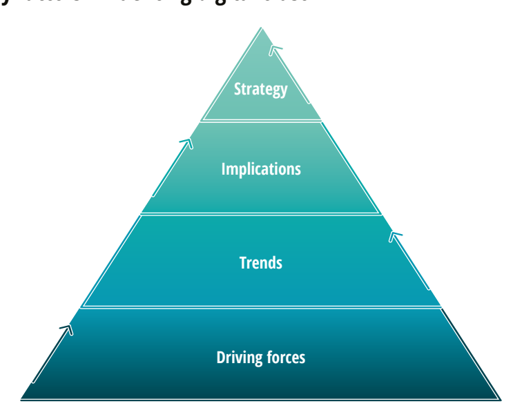
FIGURE 1 Hierarchy of key factors influencing digital trust