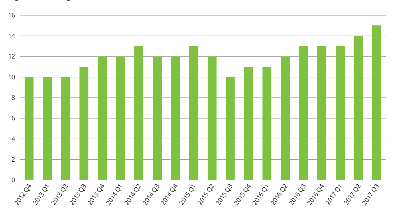
Figure 4. Average EV/TTM EBITDA, S&P 500 Chemicals Index (2012 to 2017)

While it is not expected that financial buyers will become the dominant player in the chemical M&A market, it is expected that they will continue to participate actively in the market in 2018 as they look to deploy their capital.