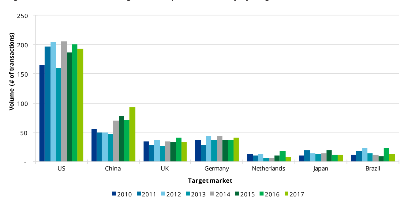
Figure 6. Global chemical merger and acquistions activity by target market (2010 to 2017)

assets, and German companies shedding non-core assets associated with previous mega-deals. This section examines M&A activity by geographic location of the target.