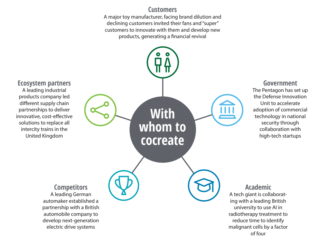
FIGURE 4 Types of cocreation partners