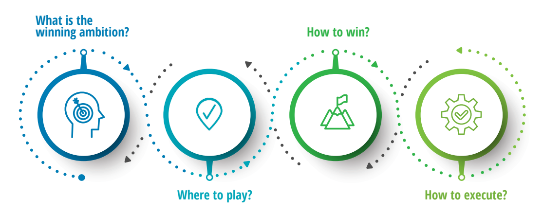
FIGURE 1 Strategic choices that illustrate our research findings