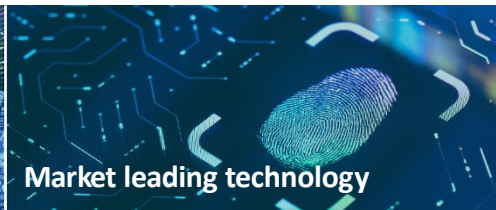
Market leading technology