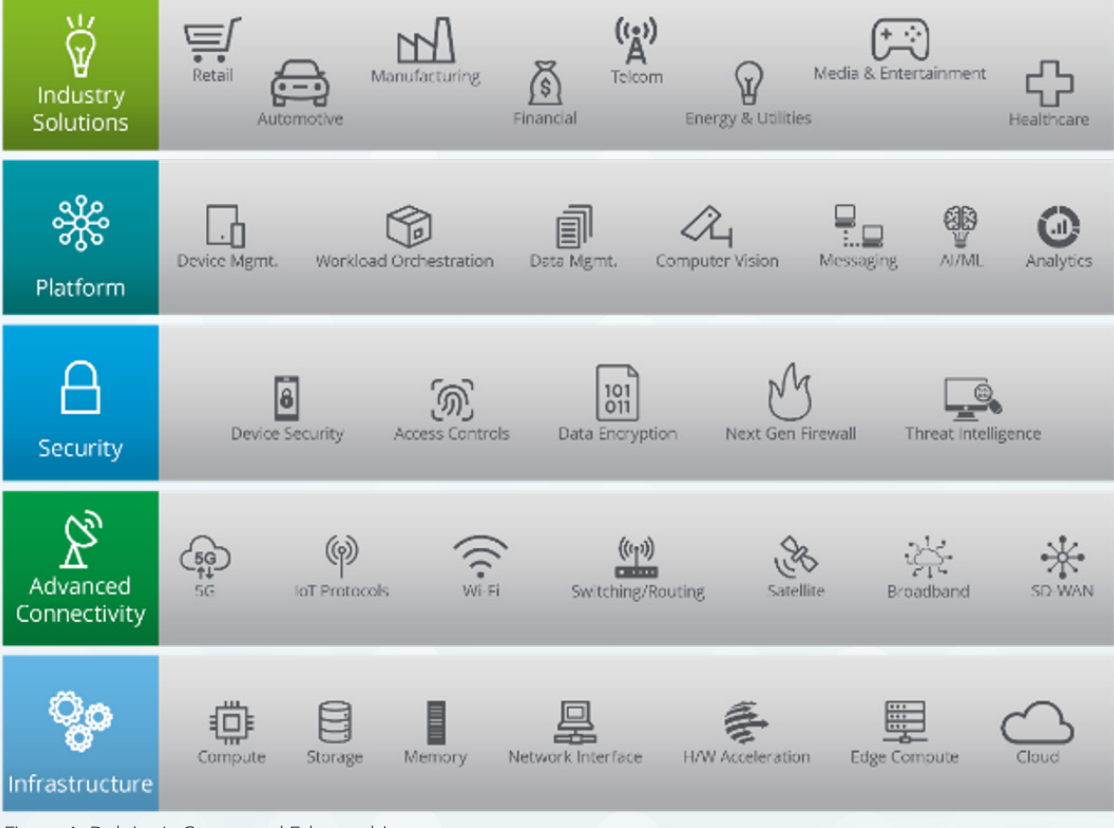
Figure 1. Deloitte's Connected Edge architecture

Deloitte's connected edge initiative is an example of a 5G, AI-powered edge network that is designed with a sharp focus on security and compliance. Securing the edge infrastructure, shown in Figure 1, and its AI-powered applications while complying with industry standards and regulations is discussed in the following sections.