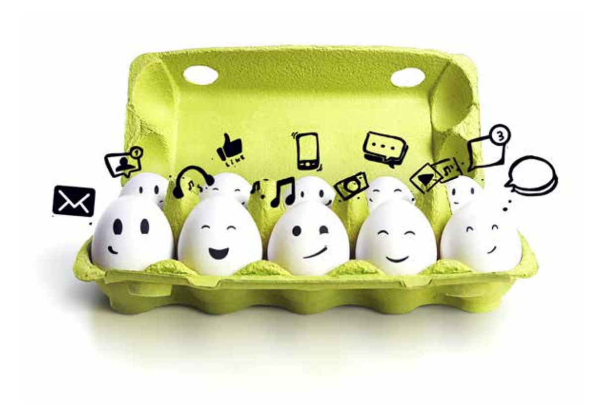
Who says banks can't be social? Become a social bank, inside and out