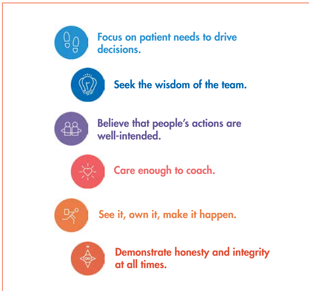
▲ Indivior’s guiding principles

In terms of technology deployed for data analytics, financial planning, and group consolidation, Indivior leveraged SAP Business Warehouse running on SAP HANA, SAP HANA Live, SAP Business Objects Planning and Consolidation running on SAP HANA, and SAP Integrated Business Planning, which is optimized for SAP HANA. It also selected