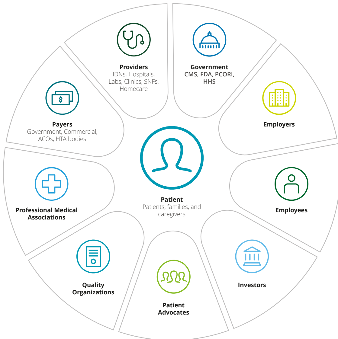
Figure 3. Key Diagnostic Stakeholder Groups

It is important to recognize that these five categories are relevant across the health care ecosystem and reflect the perspectives and priorities of many different stakeholders – payers, providers, new “at-risk” providers who must think like payers, government agencies, and of course, patients, caregivers, and patient groups. These stakeholders are highlighted in Figure 3.