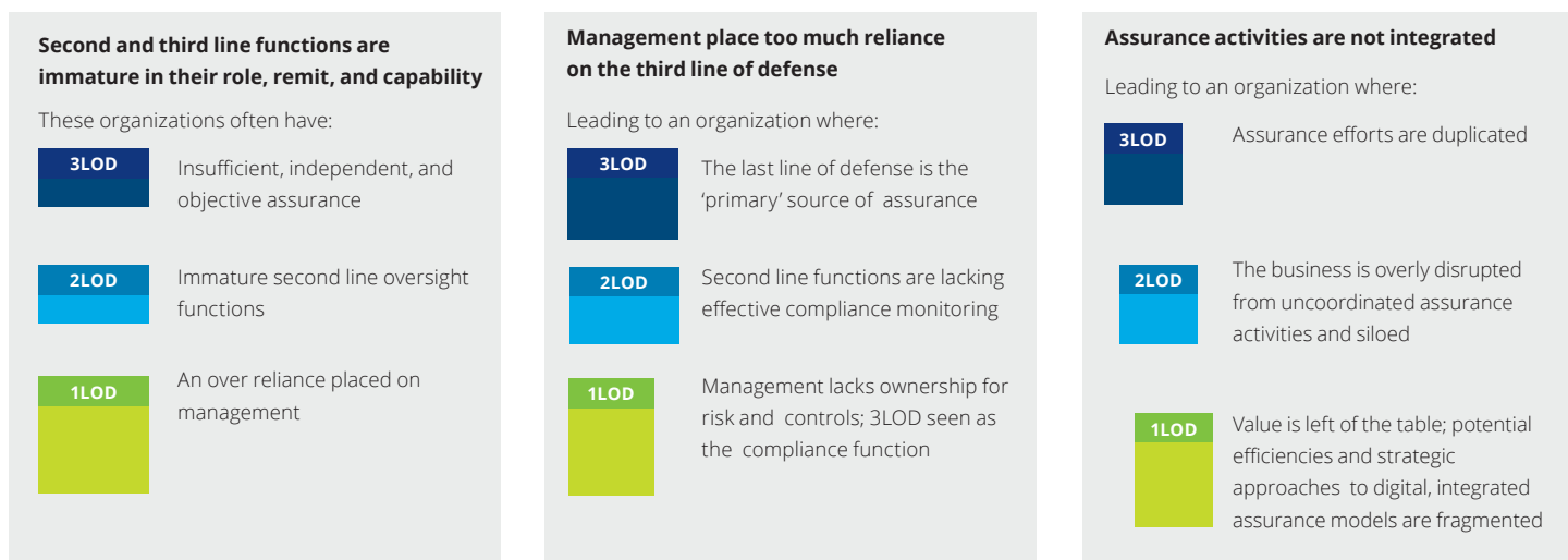
Figure 1: The changing face of assurance and compliance monitoring

Having originated in the financial services sector in the late 1990s and early 2000s, 3LOD has been widely adopted across all industries, albeit to varying degrees, since the Institute of Internal Auditors (IIA) formally adopted the model in 2013. The level of adoption broadly correlates to the strength of regulatory pressure. In most industries, smaller or emerging organizations typically lack the three defined and distinct lines, with overlapping first- and second-line roles or overlapping second- and third