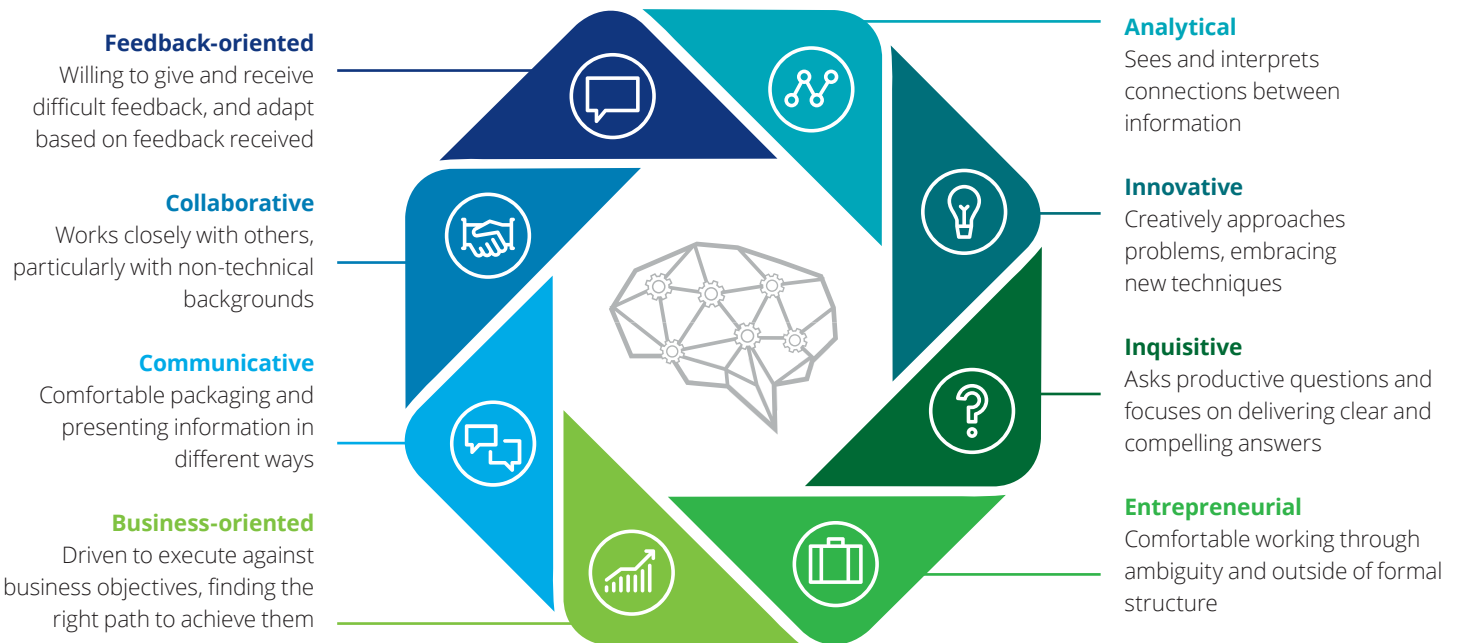
Figure 3: Internal Audit of the future | Inside an innovative mindset