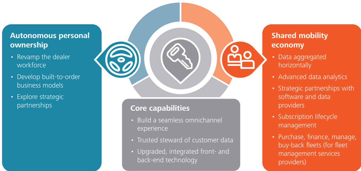
Figure 3. Capabilities in the future states of mobility