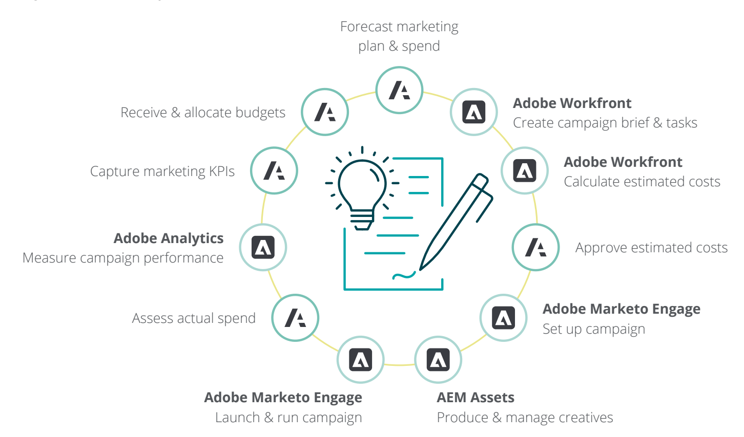
Fig. 1 - Overview of Anaplan and Adobe features in Deloitte's CLM Solution

Once a campaign is approved, the marketing operations team can move on to the preparation and execution phases. Adobe Workfront safeguards collaboration during the process, while Adobe Marketo Engage orchestrates an omnichannel campaign with brand assets – both existing and newly produced creatives – centrally managed by AFM Assets.