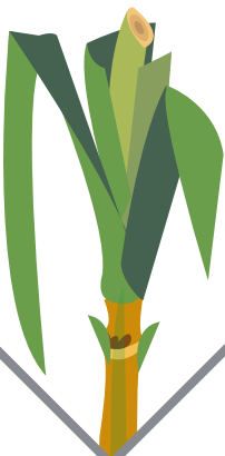
Sugarcane on sugarcane roots