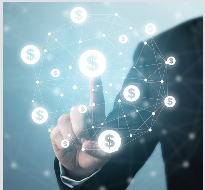
Digital advances could mean big changes for the tax profession

As data is increasingly aligned and integrated across an organisation, more financial transactions – supported by cloud-based