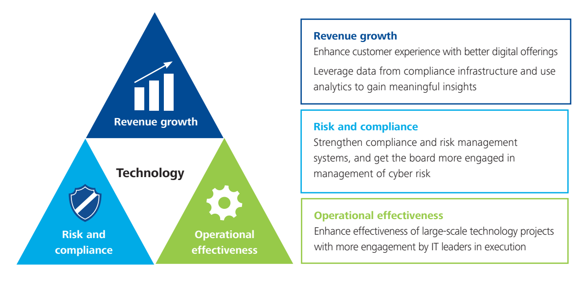
Figure 5. Technology is a central driver of business priorities