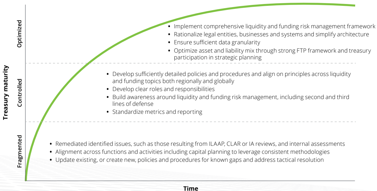
Figure 1: Illustrative treasury maturity curve

On the maturity curve continuum of fragmented, controlled and optimized, we have seen many firms fall under the spectrum of fragmented and controlled, even while understanding and appreciating the importance of moving toward an optimized operating model.