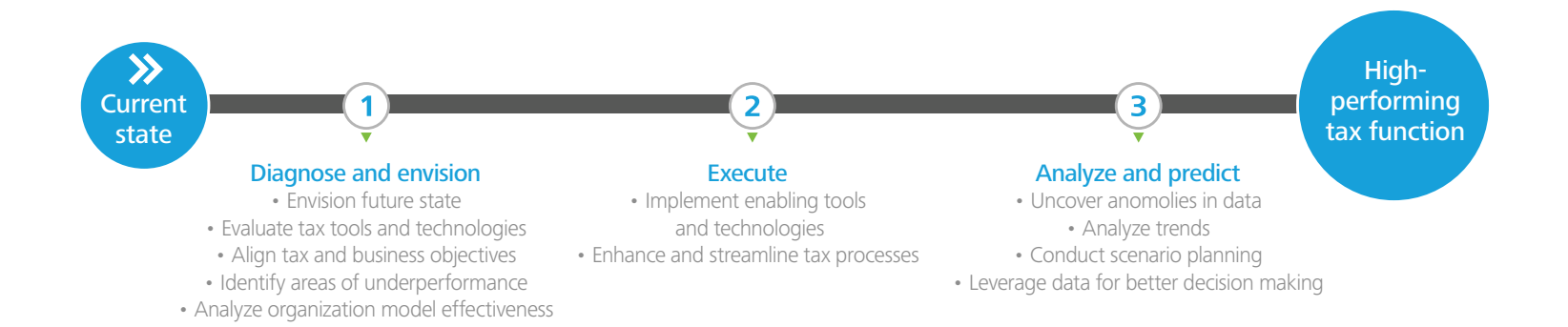
Figure 1. An innovative suite of services for high-performing tax departments

Whether the issue is discrete tax compliance or something broader such as faster closing cycles or resource management, the issue you face today can be the launching point for tax transformation. With Deloitte's innovative suite of services, we can quickly diagnose your challenges, assist in executing performance improvement plans, analyze current operations, and predict likely future outcomes (Figure 1).