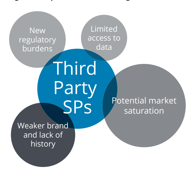
Figure 4 - Impact on TPSPs: challenges

services that would allow them to target untapped consumer segments.