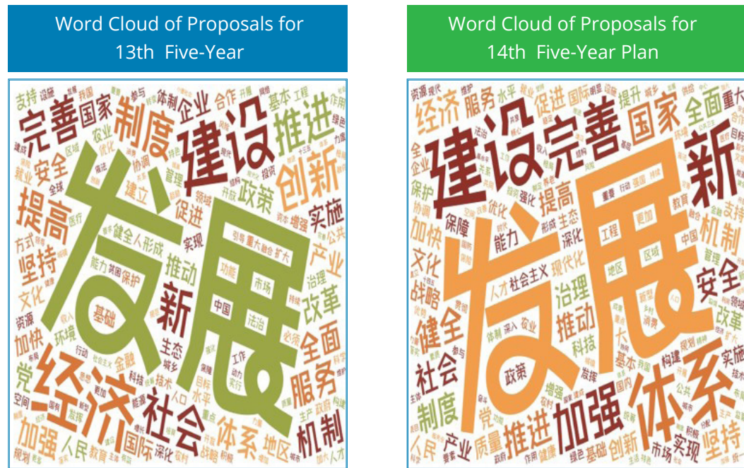
Figure 1 Words used in the Proposals for 13th Five-Year Plan and Proposals for 14th Five-Year Plan

government's emphasis on risk prevention and highlighting the importance of keeping worst-case scenarios in mind. Finally, innovation is mentioned repeatedly in the Proposals for 13th Five-Year Plan and the most recent Proposals, but in the latest document, science and technology are also mentioned consistently, which shows the government will attach great importance to scientific and technological innovation in this new stage of China's economy.