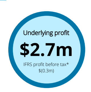
*IFRS profit before tax has been adjusted by various one-off and extraordinary items to arrive at underlying profit.

The diagram to the right<sup>3</sup> is also based on disclosures often made in the OFR. Even though the non-IFRS measure is accompanied by the related IFRS measure, the non-IFRS measure is clearly intended to be more prominent than the IFRS measure. Further, the explanation provided refers to 'extraordinary' items (specifically prohibited by RG 230) and is not specific enough to allow reconciliation to other amounts in the financial statements.