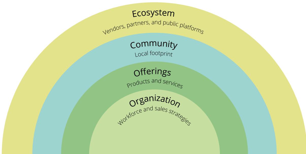
Figure 1. The Deloitte Financial Inclusion Framework

Companies and investors are beginning to recognize the social and financial opportunities inherent in financial inclusion and are acknowledging the long-term value in the pursuit of a higher bottom line. 1 In this report, we explore in detail Deloitte's Financial Inclusion Framework (figure 1), with lessons learned from a project that sought to identify inclusive and profitable financial offerings.