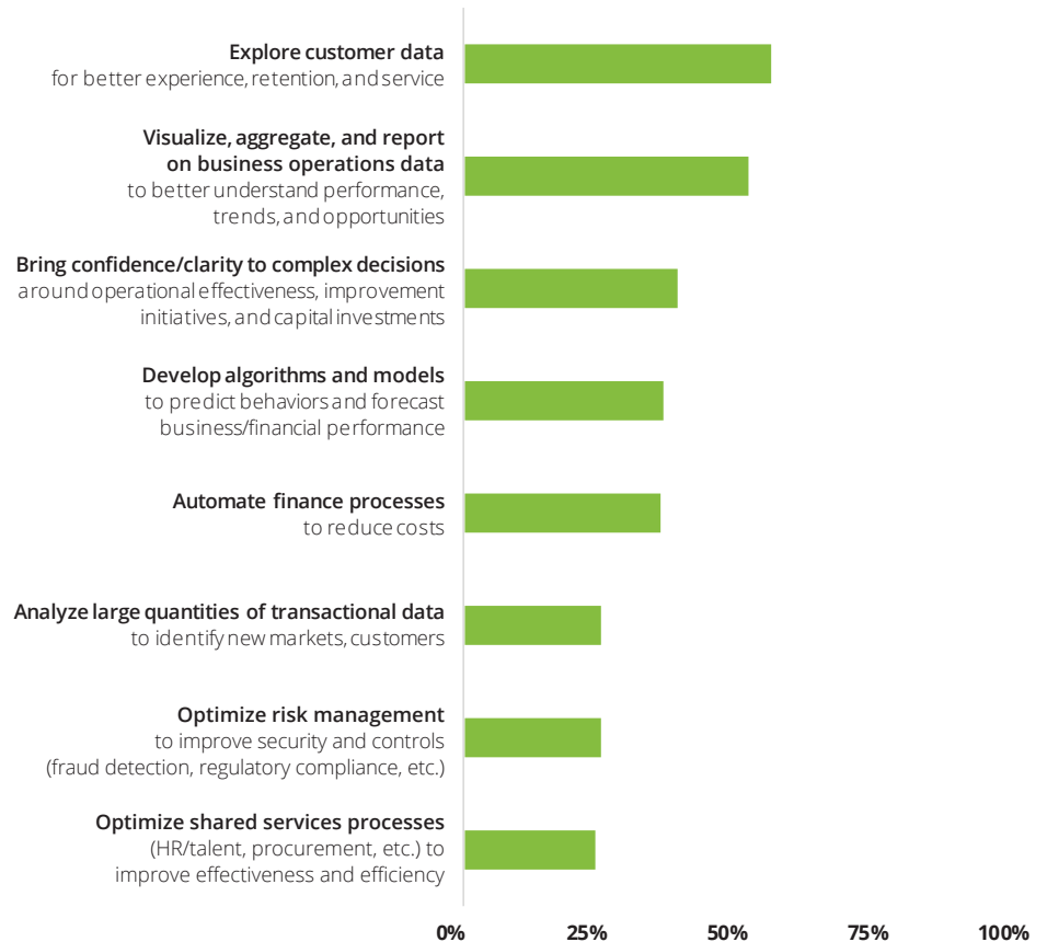
Percent of CFOs selecting each policy area in their top three (n=121)

How CFOs at large North American companies regard data visualization in the context of their analytics strategies