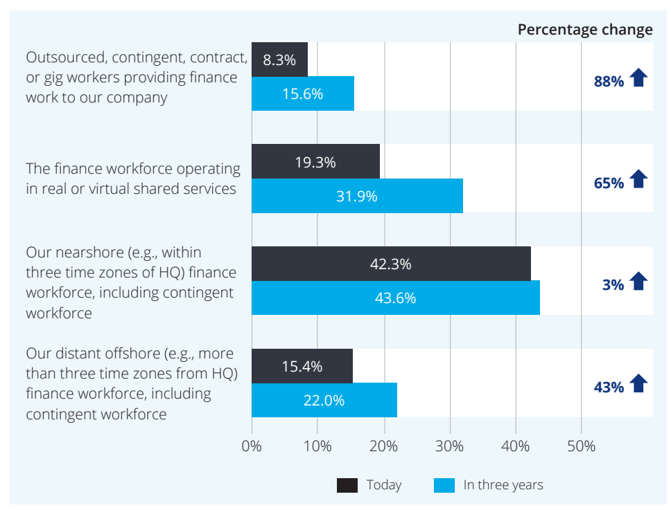
Figure 2. CFOs' workforce expectations (Percentages reflect workforces today and in three years.)