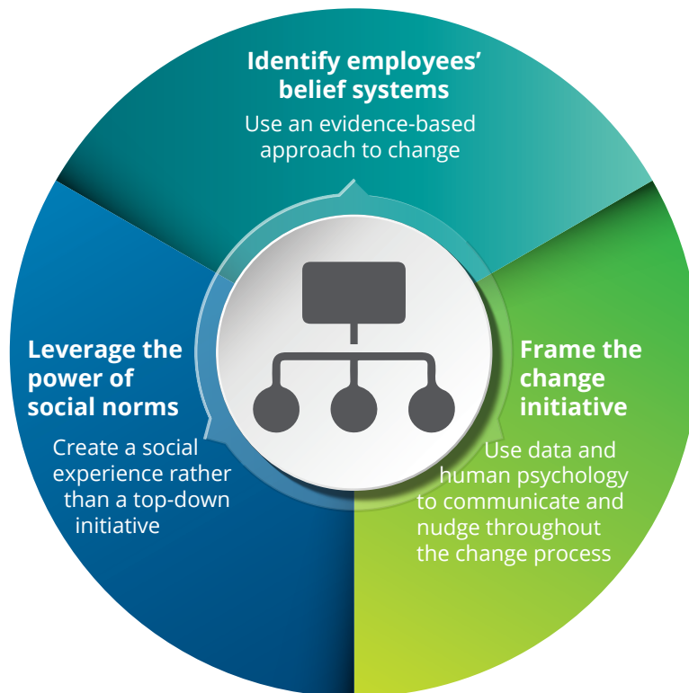
Figure 3. Humanizing organizational change