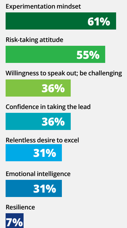
Figure 2. Which leadership attributes do your organization's leaders need more of to drive digital business transformation? (Please select top three)