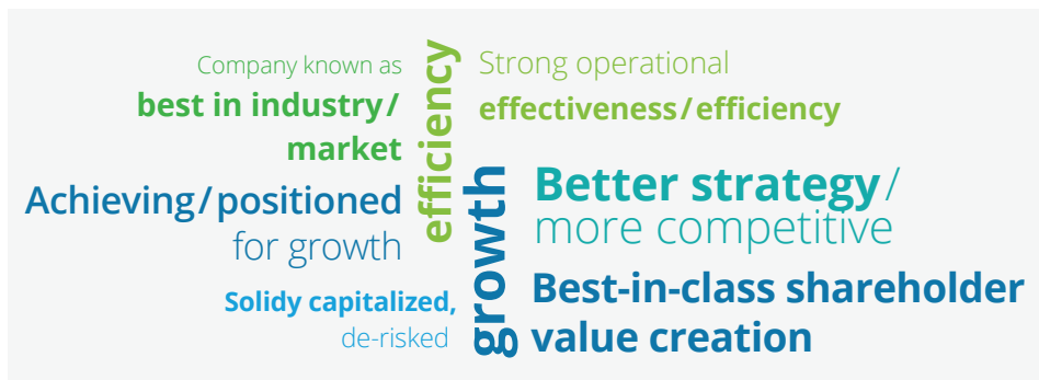
Figure 1. CFO legacies: What finance chiefs say they hope their company legacies will be

Source: CFO Signals, Q2 2018, CFO Program, Deloitte LLP.