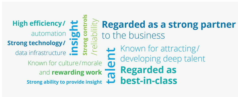
Figure 2. CFO legacies: What finance chiefs say they hope their team legacies will be