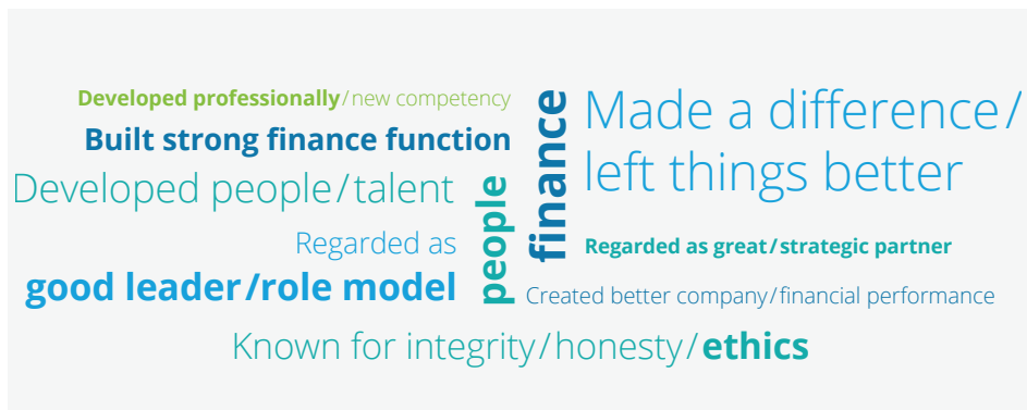
Figure 3. CFO legacies: What finance chiefs say they hope their personal legacies will be