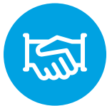
Figure 3. What bank associates need

The old model of relatively low-skilled resources and high employee turnover will need to be turned on its head to enable this shift to more impactful human interactions between bank associates and customers. Banks will have fewer, but better-trained and more motivated, loyal associates; they will shift from strictly defined work processes to more flexible guardrails that give associates more flexibility for higher-value, complex tasks and conversations.